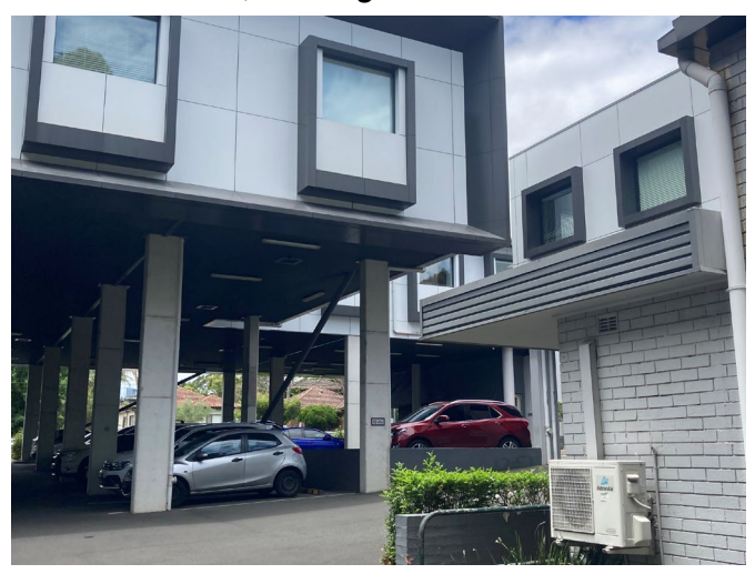
View of rear of undercroft area and existing carpark, looking south-east.