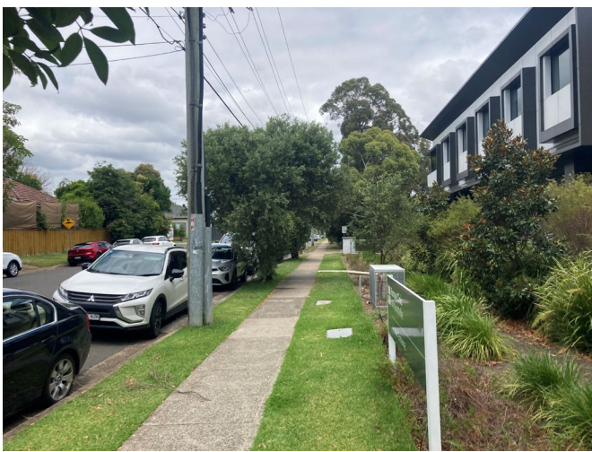
View of site frontage to Lytton Street, looking south.