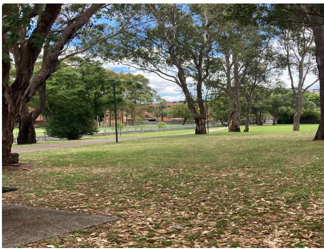
View of Lytton Street Park and Finlaysons Creek culvert, looking north-west.