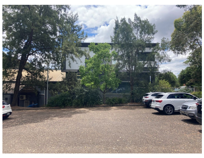
View of connection point from within southern carpark, looking north.