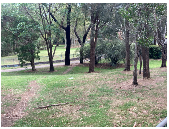
View of Lytton Street Park and Finlaysons Creek culvert, looking north-west.