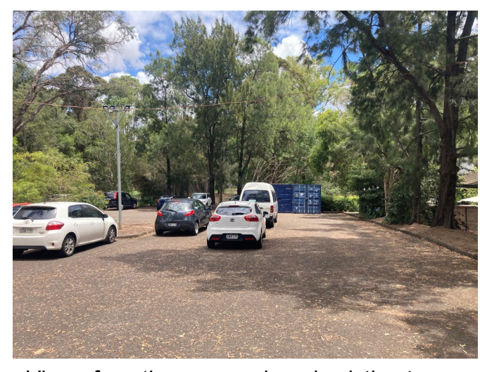
View of southern carpark and existing trees, looking west.