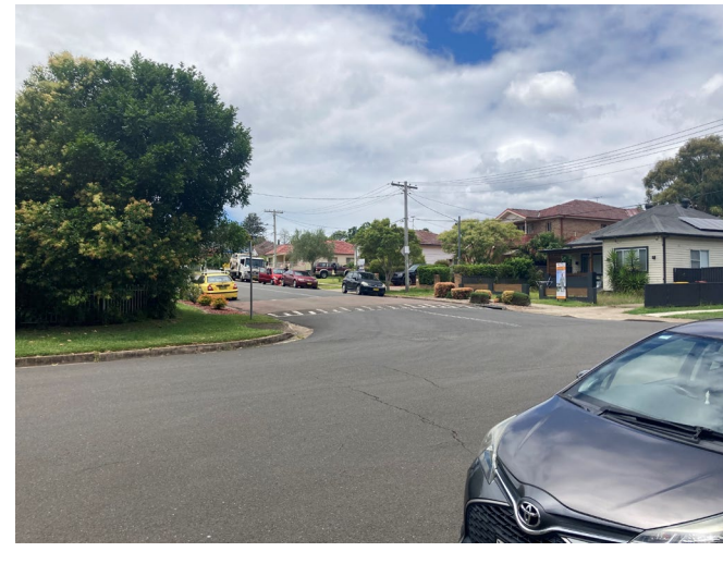
View towards Haig Street (from which overland flow paths into the site typically originate), looking south-east.