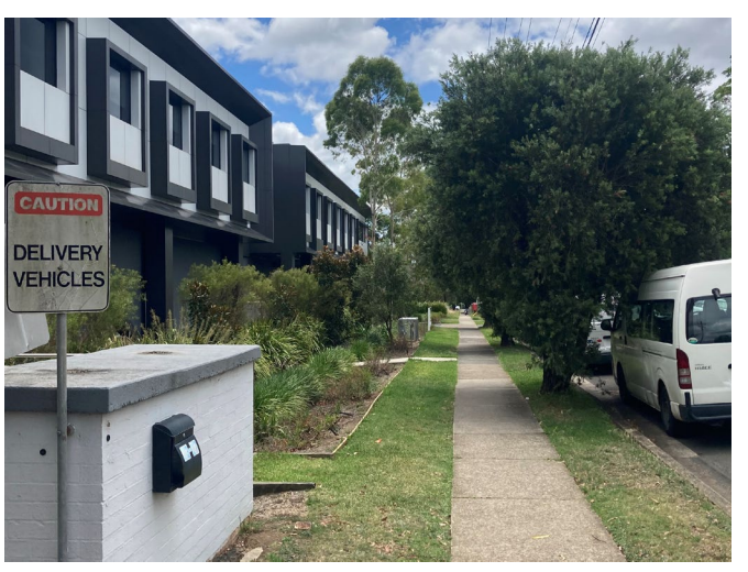
View of site frontage to Lytton Street, looking north.

The Panel also noted the typical overland flow path into the site during flood events from nearby Haig Street.