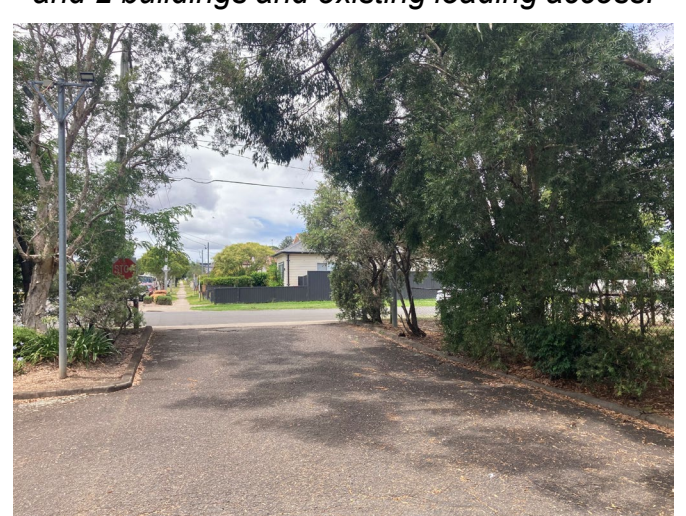
View of existing trees and carpark entry (approximate future substation location at image far left), looking east.