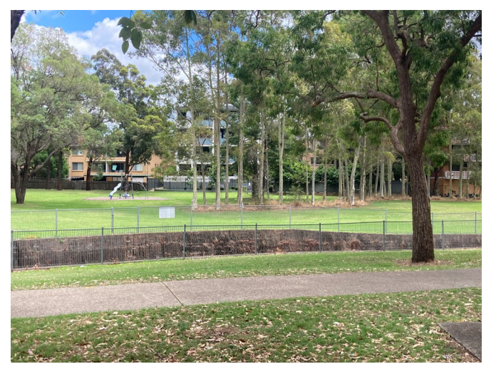
View of Lytton Street Park and Finlaysons Creek culvert, looking west.

The Panel noted the flood levels within the existing undercroft area and carpark.