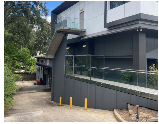
View of connection point between Stage 1 and 2 buildings and existing loading access.

The Panel viewed the proposed connection point of the Stage 2 building with the Stage 1 building, the existing southern carpark, Lytton Street Park and Finlaysons Creek culvert, the location of the future substation, and existing trees proposed for removal.