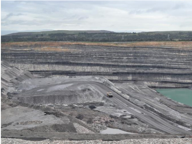
View of the existing Glendell Pit looking south-west.