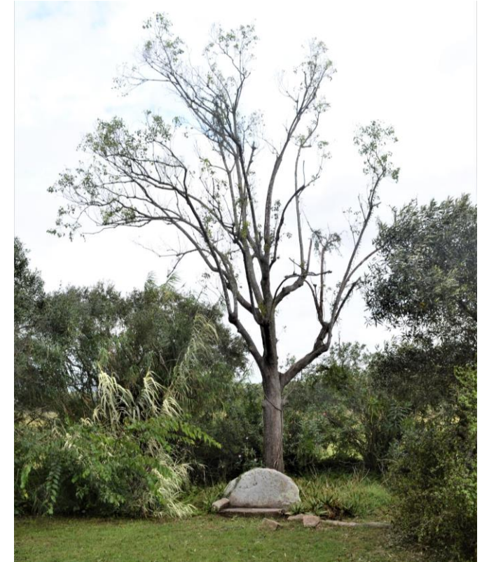
View of the house garden to the south of the main house building. View looking west.