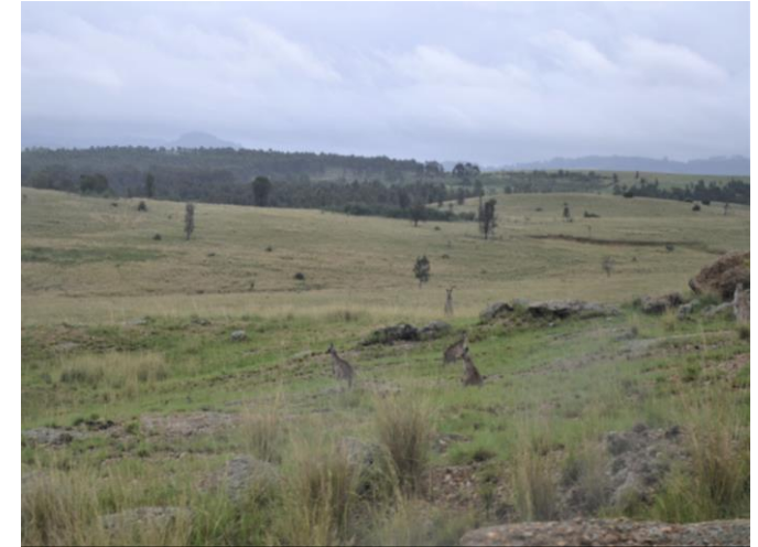
View looking north-east across the proposed pit extension area.