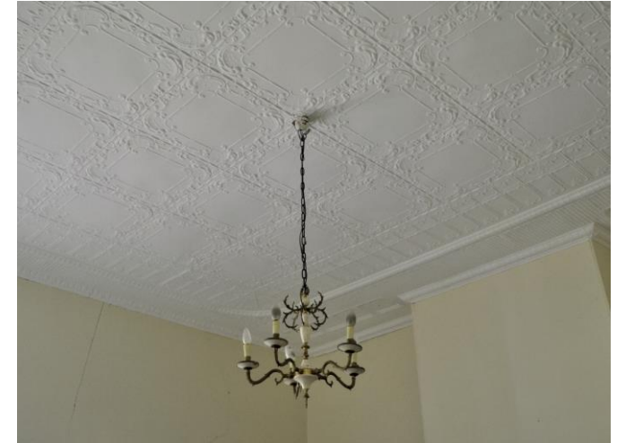
Interior view of the main house building.