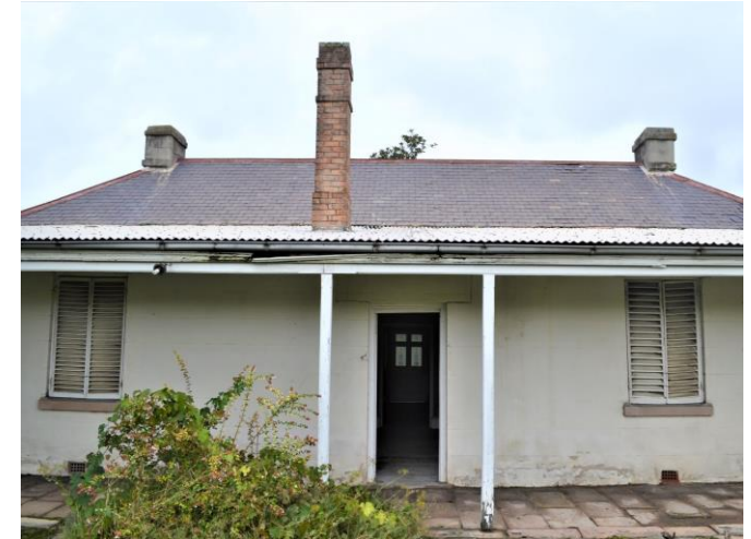
View of the main house building (rear) from within the Ravensworth Homestead farmyard square. View looking south.