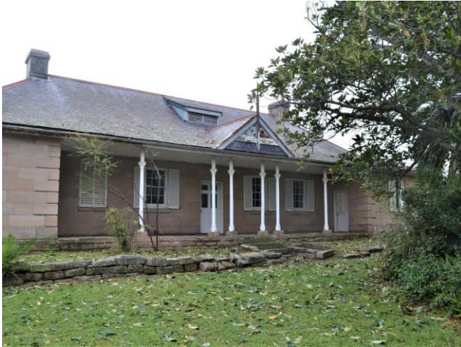
View of the main house building (front) looking north-east.