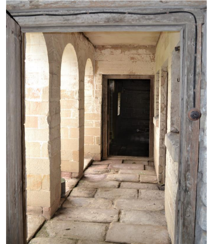
Interior view of the stable building archway.