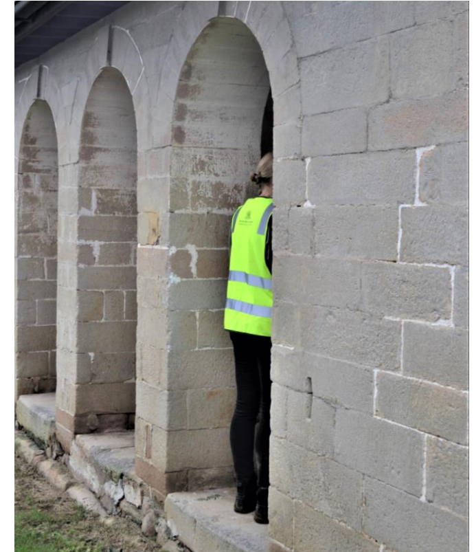
Exterior view of the stable building archway.