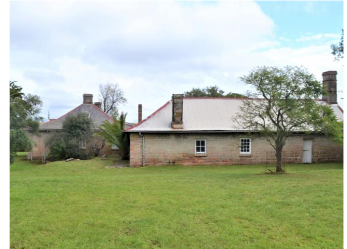
View of the main house building and kitchen wing looking west.