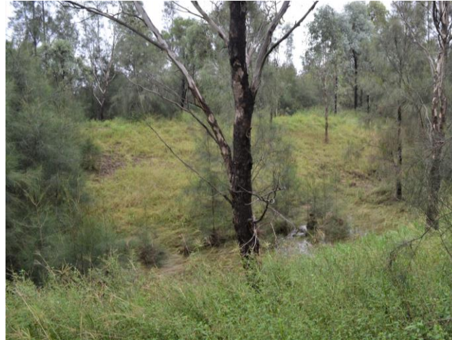
View of the existing Swamp Creek diversion looking south-west.