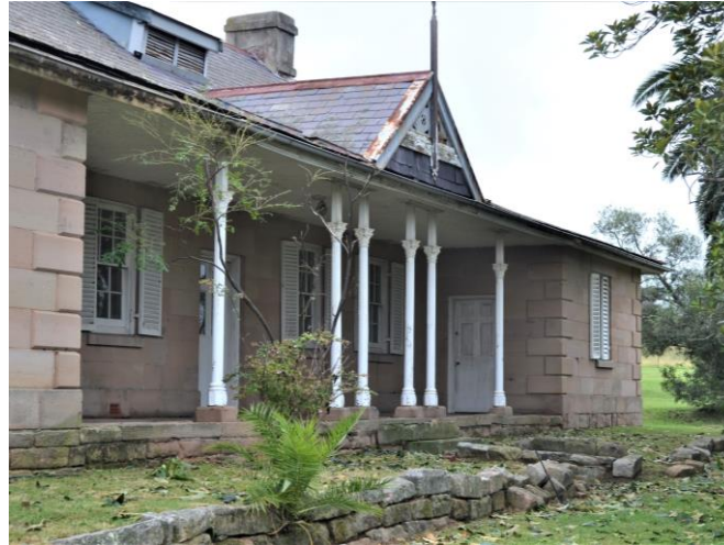
View of the main house building (front) looking north-east.