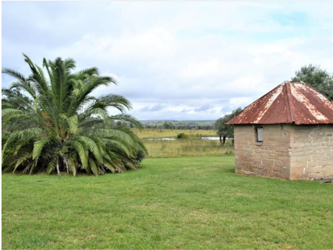
View looking south to the privy (rear) and house dam beyond.