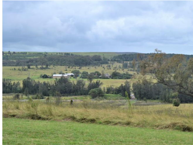
View looking east across the proposed pit extension area with Yorks Creek and Hebden Road in the foreground and the Ravensworth Homestead Complex in the middle distance.