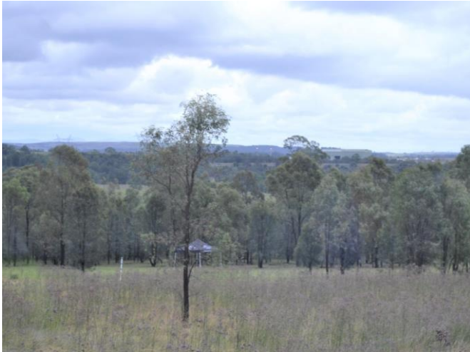
View of the Ravensworth Farm site (proposed Ravensworth Homestead Complex relocation site option).