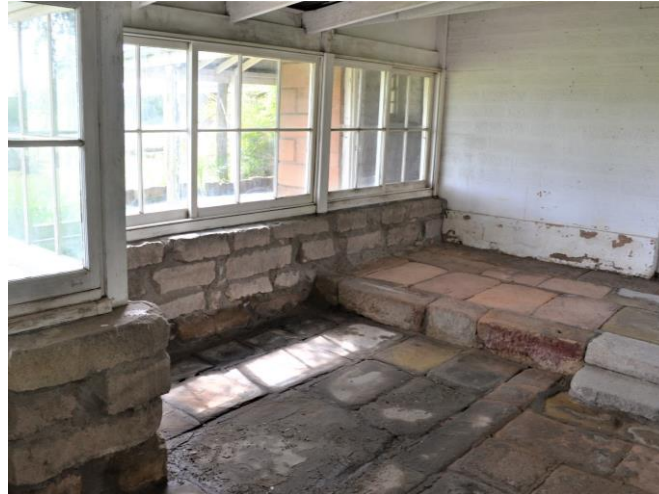
Interior view of the main house building.