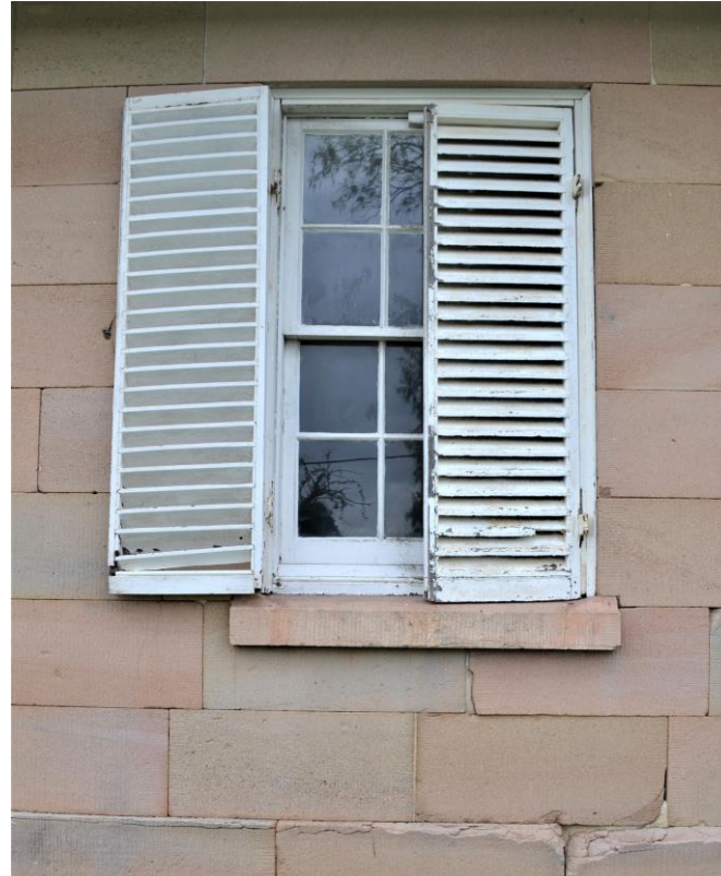
View of exterior window on the western elevation of the main house building.