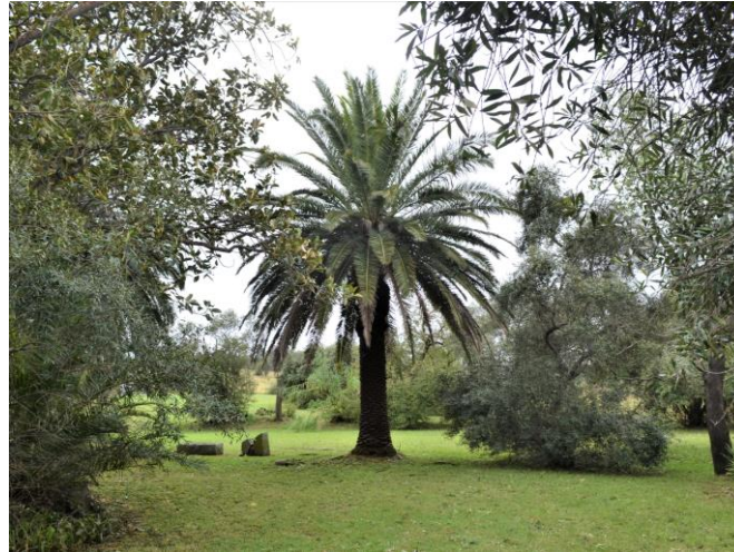
View of the house garden to the south of the main house building. View looking east.