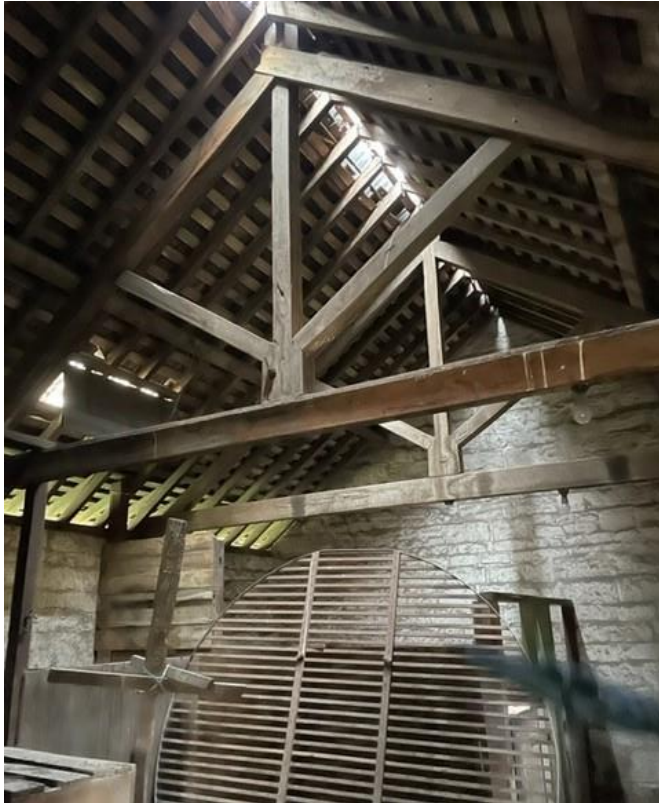
Interior view of the stable building rafters.