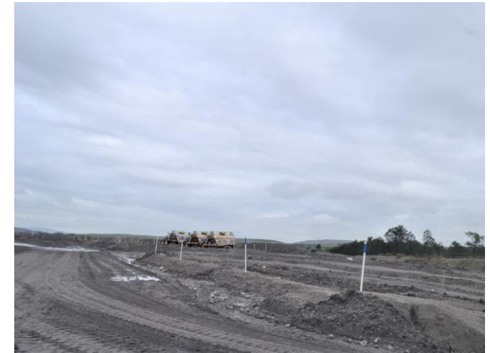
View of a cleared area and parked mining vehicles to the south of Swamp Creek, near the Glendell Mine Infrastructure Area. View looking west.