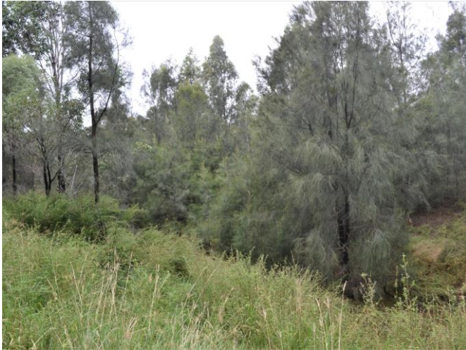
View of the existing Swamp Creek diversion looking south-east.