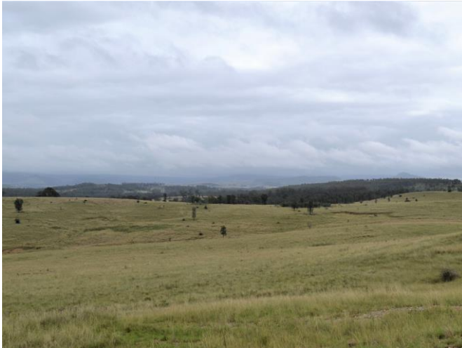
View looking north across the proposed pit extension area (with Ravensworth Homestead beyond the visible hills).

Vantage Point (location in southern part of proposed pit extension area)