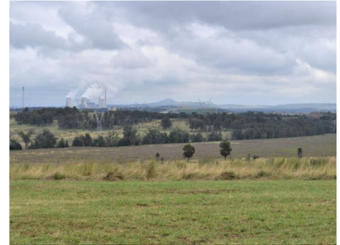
View looking north-west towards Liddell Power Station and Bayswater Power Station.