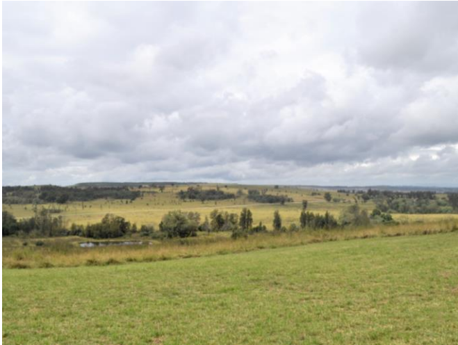
View looking west towards Bowmans Creek.

Vantage Point (location at western edge of proposed pit extension area)