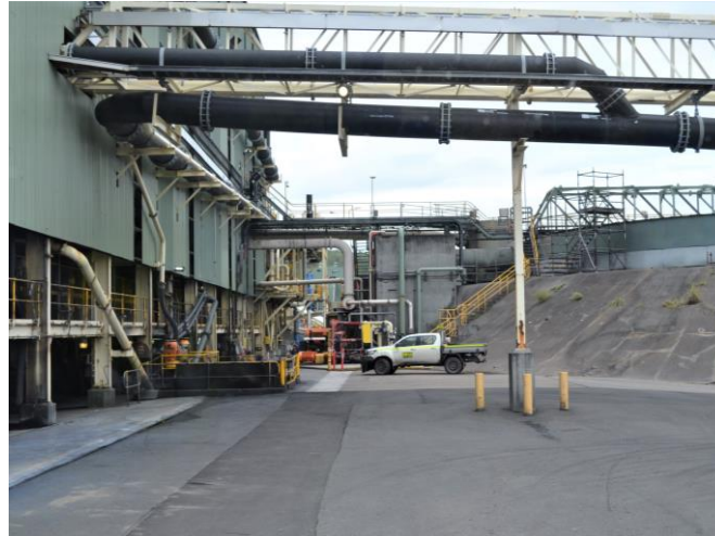
View of the Mount Owen Coal Handling and Preparation Plant.