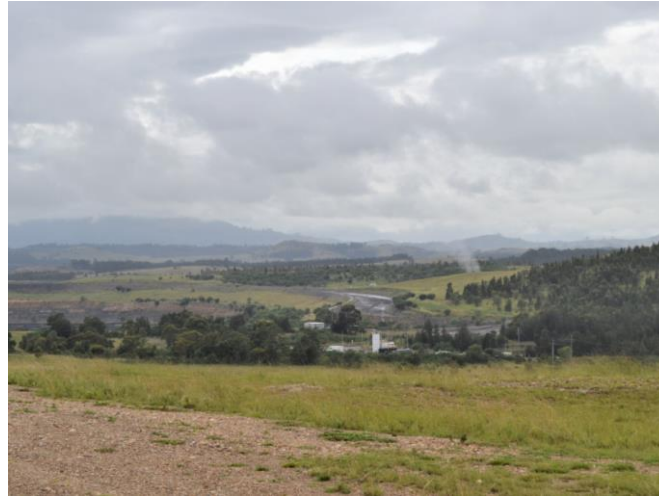
View looking east towards the Ravensworth East Emplacement Area and West Pit.