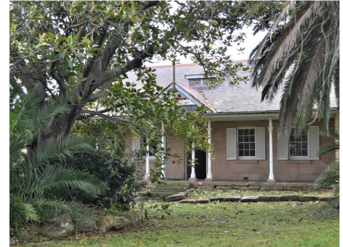
View of the main house building (front) and surrounding house gardens looking north.