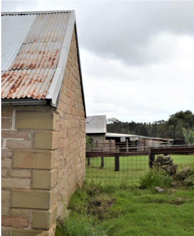
View of the out buildings and farm yards with the barn building (rear) in the foreground and stable building beyond. View looking west.