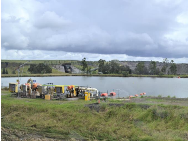
View looking west towards the Mount Owen water management area.