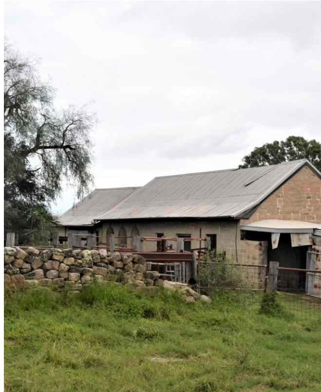
View looking south-west towards the farm yards and stable building.