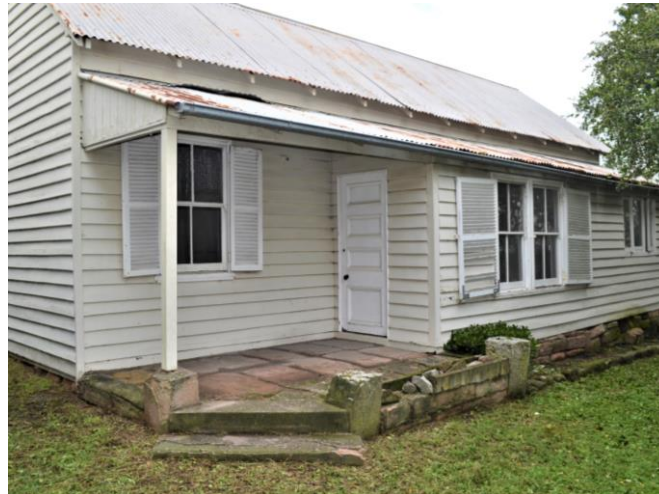
View of the men's quarters cottage looking south-east.