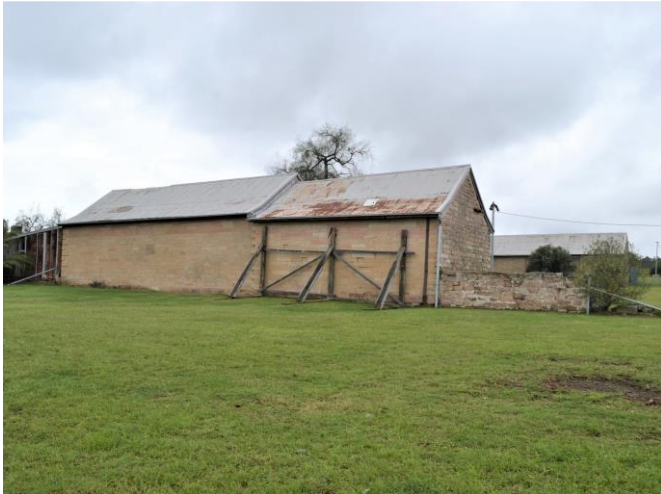
View of the stable building (rear) looking east with the farmyard square beyond.