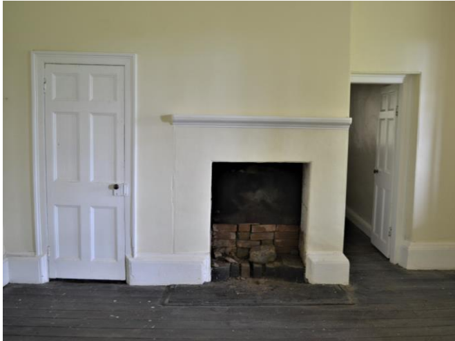
Interior view of the main house building.