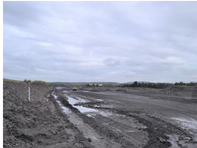
View of a cleared area and parked mining vehicles to the south of Swamp Creek, near the Glendell Mine Infrastructure Area. View looking west.

No photographs recorded of the Glendell Mine Infrastructure Area buildings. The Panel viewed the car parking area, reception buildings and infrastructure buildings.