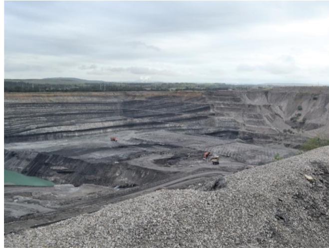
View of the existing Glendell Pit looking north-west.