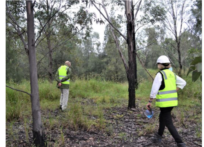
View of the vegetation surrounding the existing Swamp Creek diversion.