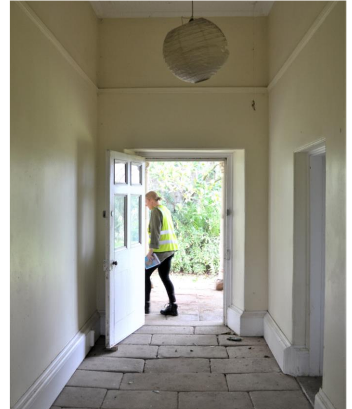
Interior view of the main house building looking south towards the house garden.