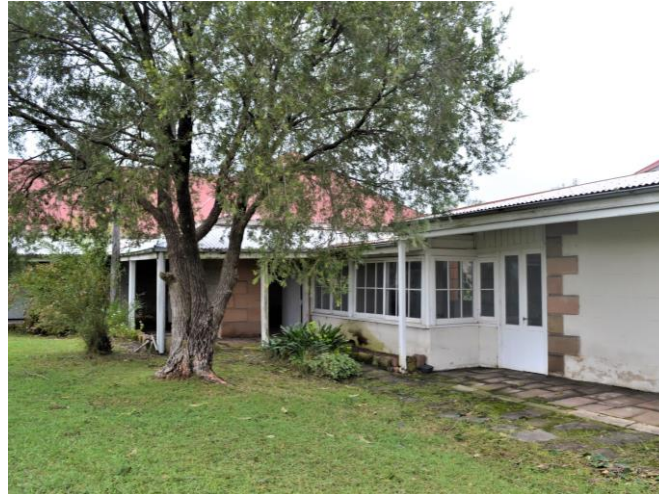
View of the main house building (rear) and later additions from within the Ravensworth Homestead farmyard square. View looking south-east.