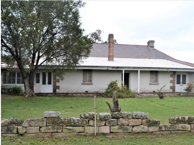
View of the main house building (rear) from within the Ravensworth Homestead farmyard square. View looking south.