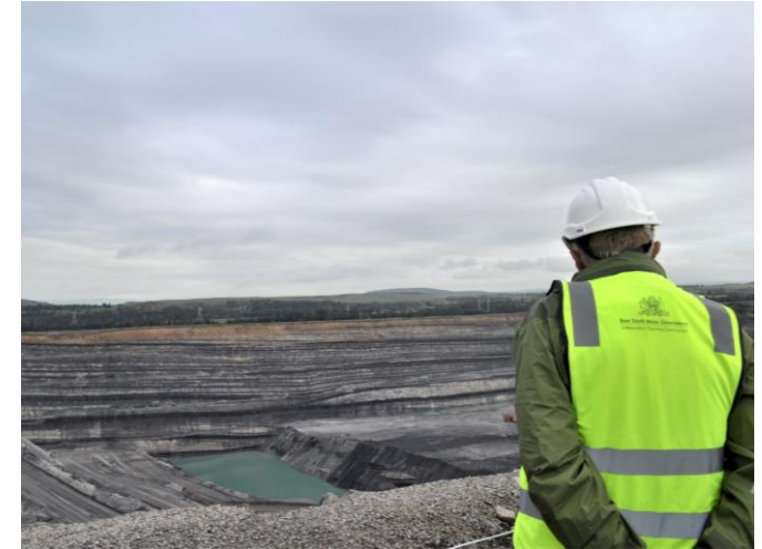
View of the existing Glendell Pit looking west.