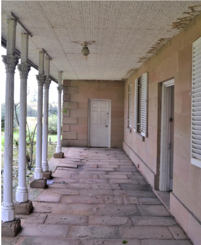
View along the front verandah of the main house building.