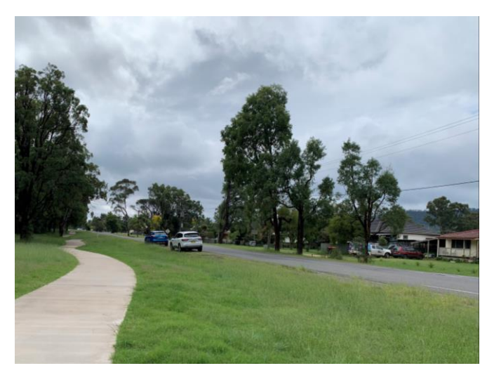
View of Wollombi Street with Broke beyond from McNamara Park. View looking north.