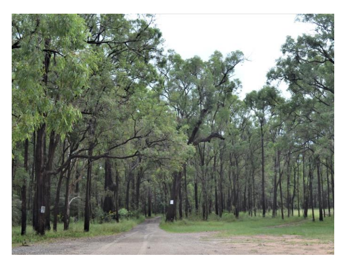
View of camping area access road from McNamara Park looking north-west.