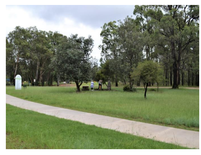
View of McNamara Park from Wollombi Street looking south-west towards Wollombi Brook.