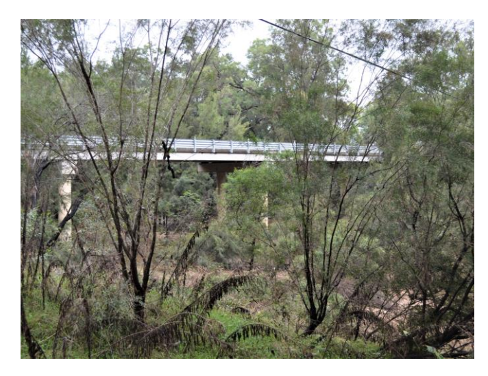
View of Herbert Street Bridge (Milbrodale Road) over Wollombi Brook looking south from McNamara Park