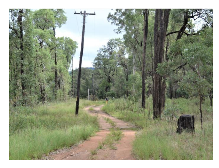
View looking west towards Wollombi Brook from McNamara Park along access road.