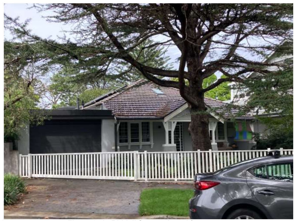
Figure 3: 15 Riddell Street, viewed from street.