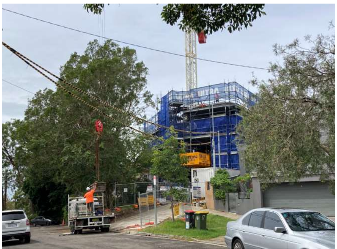
Figure 4: Apartments under construction at 21-23 Riddell Street, viewed from street.