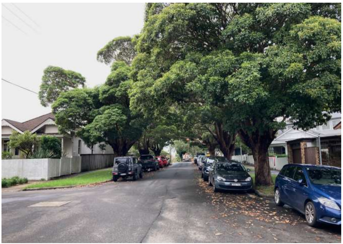
Figure 2: Riddell Street, looking north-east.