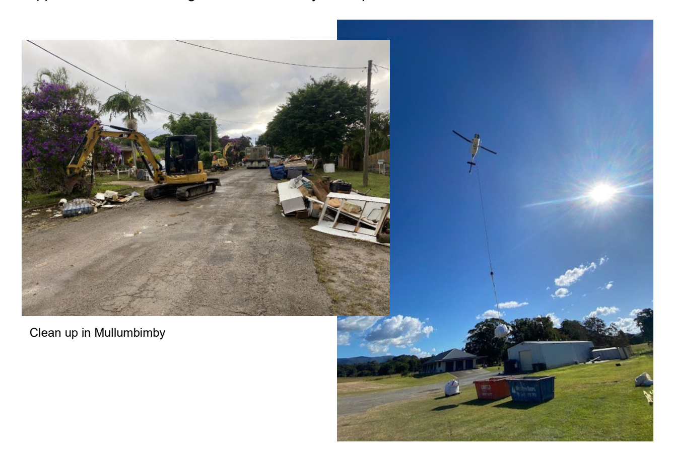
Helicopter pick up for Huonbrook

In collaboration with state government and a local landowner, Council also facilitated supplies and waste management solutions by helicopter for isolated Huonbrook residents.