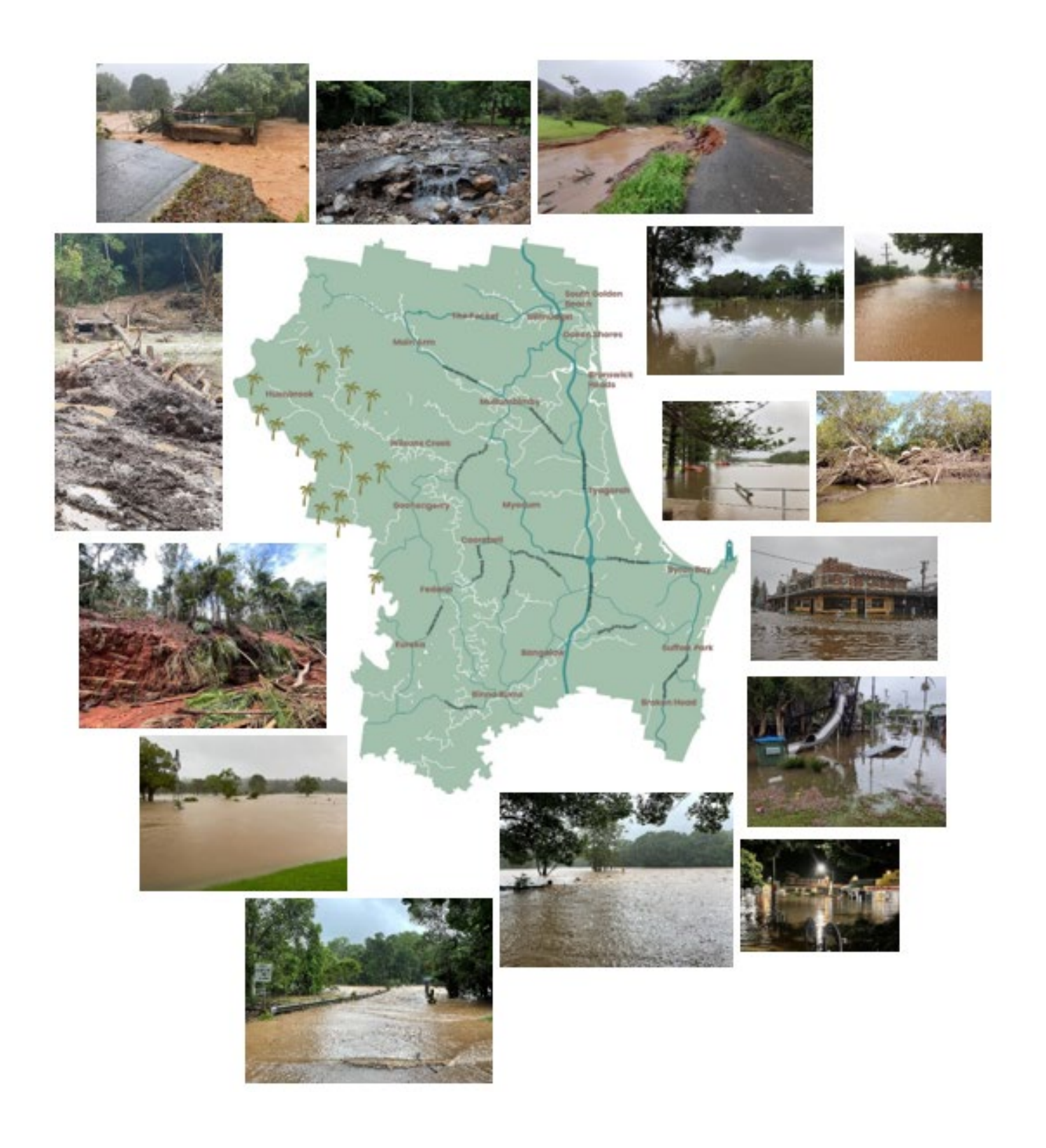
Photo montage: around Byron Shire, disaster events February-March 2022