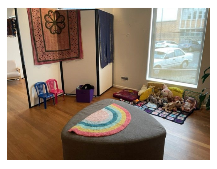
"Kid's corner" in Recovery Centre

The Recovery Centre offered access to services including Byron Shire Council (business concierge), Centrelink, Service NSW, Resilience NSW, Legal Aid, Suncorp Insurance, Allianz insurance, St Johns Ambulance, Mullumbimby & District Neighbourhood Centre, Department of Primary Industries, Department of Communities and Justice, Red Cross, Salvation Army and Rural Fire Service. Emotional and psychological support services were offered by the chaplaincy network, local psychologists and counsellors, with quiet places of refuge offered on site.