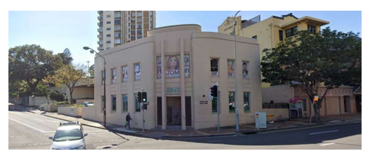
Figure 2: Street view of 136 New South Head Road Edgecliff at the corner of Darling Point Road, facing north –east

On 5 July 2021 Council also resolved that the cottages at 543-549 Glenmore Road should be investigated to determine whether these buildings fulfil the criteria for heritage listing (see Figures 4 & 5 ).