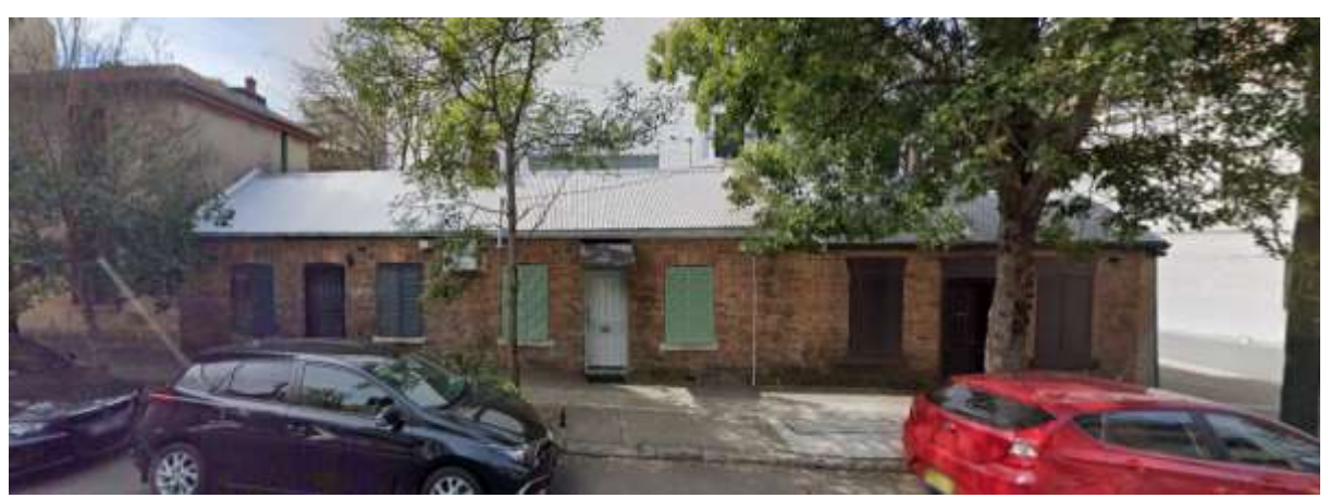
Figure 5: Street view of the three single storey timber workers' cottages at 543-547 Glenmore Road Edgecliff from Glenmore Road facing east