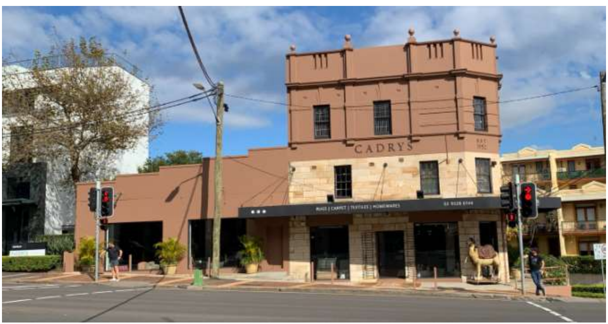
Figure 3: Cadry's Building, 133 New South Head Road, Edgecliff viewed from New South Head Road facing south