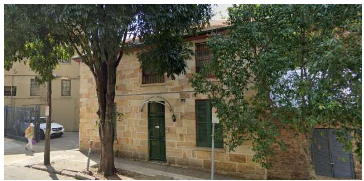
Figure 4: Street view (obscured) of the two-storey sandstone workers cottage at 549 Glenmore Road Edgecliff from Glenmore Road facing east