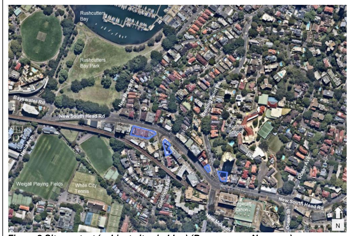
Figure 2 Site context (subject sites in blue)