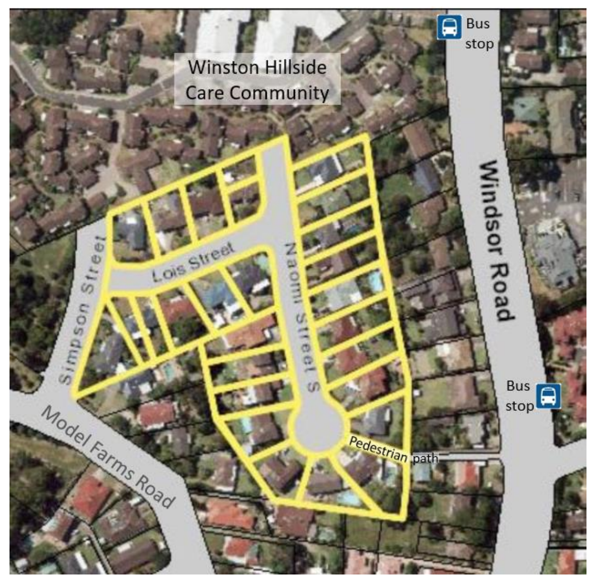
Figure 1 The subject sites, highlighted in yellow

links the subject sites to Windsor Road. The sites are all within approximately 500 metre walking distance of existing bus stops on Windsor Road, which is a major bus corridor and Model Farms Road (Figure 1).