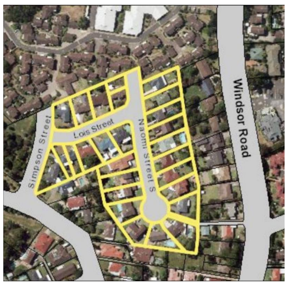
Figure 1 - 27 properties subject to the Planning Proposal

1.1. This report supports a request for a Gateway review with respect to the properties at 5A , 51-61 and 64-82 Naomi Street South , 1-5 and 2-8 Lois Street and 1 and 3 Simpson Street , Winston Hills (total of 27 properties ); see Figure 1.