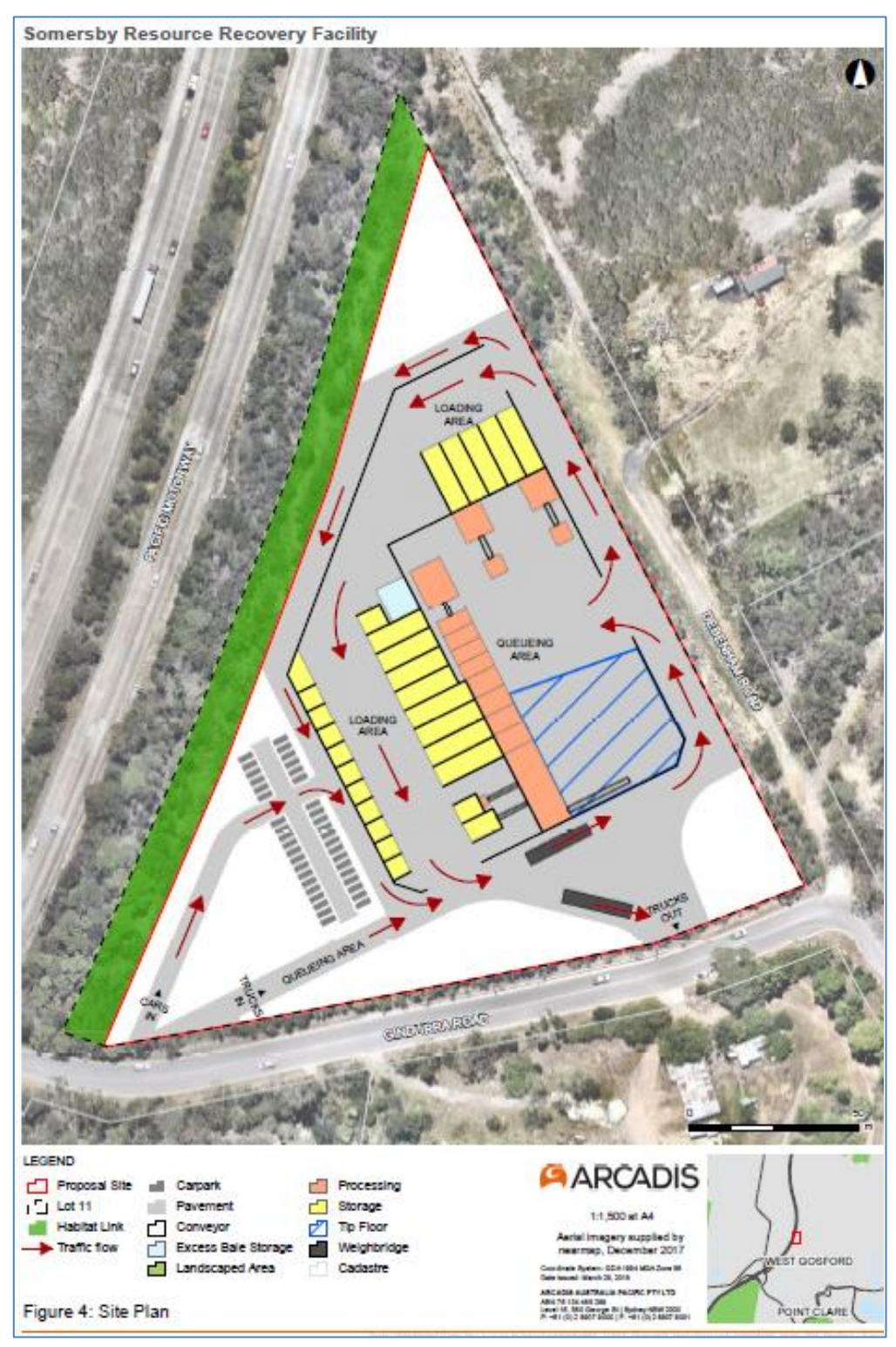
Figure 2. Design of (withdrawn) Bingo Somersby Resource Recovery Facility across the road form the proposal

The other issues raised in this regard include that there is no full enclosure on any of the main dust generating activities, despite this claim being made by the proponent and various others a structure where the long side is fully open offers only a small benefit, and is far from offering the mitigation that a full enclose would provide, (for example, approximately 30% vs, 90% control, which is 70% emitted vs 10% emitted, or in plain English it leads to seven times less emissions reduction compared with the same plant operating within a full enclosure).