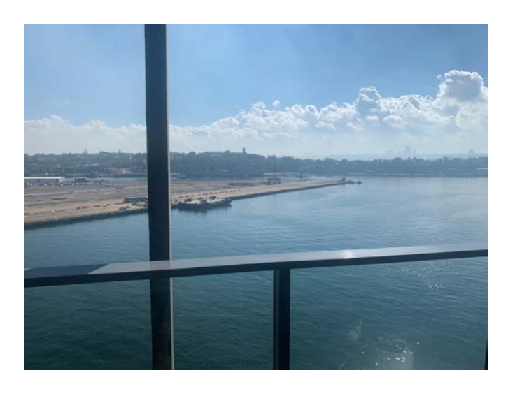
Location 2 – Waterfront Park, Pyrmont