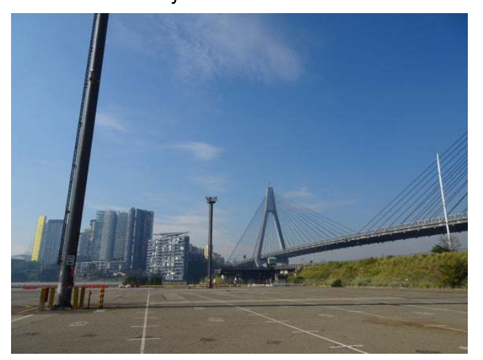
Location 1: Project Site