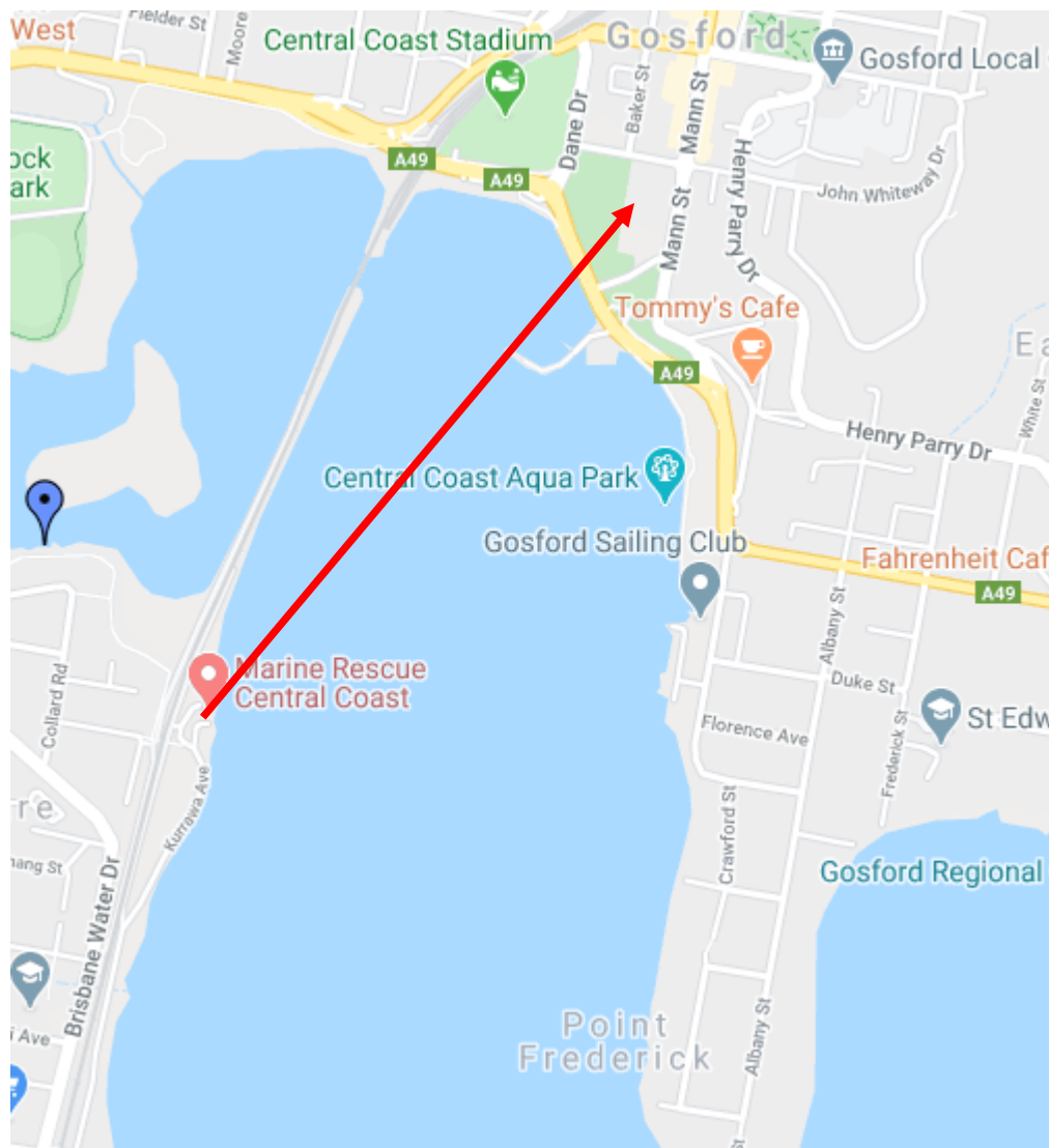
Figure 2: View from Point Clare reserve to the Site (View 3)