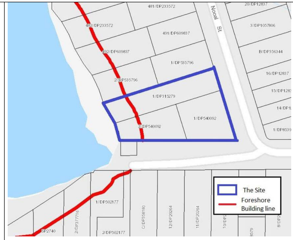
Figure 6: Foreshore building line

The original planning proposal submitted to Council by Boston Blyth Fleming Town Planners on behalf of Crystal Apartments Pty Ltd sought to amend Schedule 1 of Pittwater LEP 2014 to permit seniors housing as an additional permitted use on the site. The supporting concept design for the proposal included eight seniors' independent units with a total floor space ratio of 0.5:1 and up a height of 8.5m.