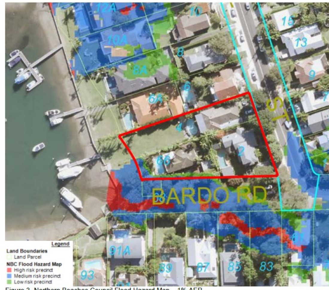
Figure 3- Northern Beaches Council Flood Hazard Map – 1% AEP Newport Flood Study 2019 - 1% Annual Exceedance Probability (AEP) flood event