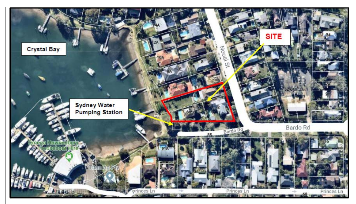
Figure 2: Aerial view of site