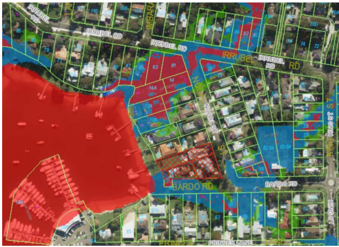
Figure 4: Draft Newport Flood Study 2018 high (red), medium (blue) and low (green) flood risk (site shown red crossed hatched)