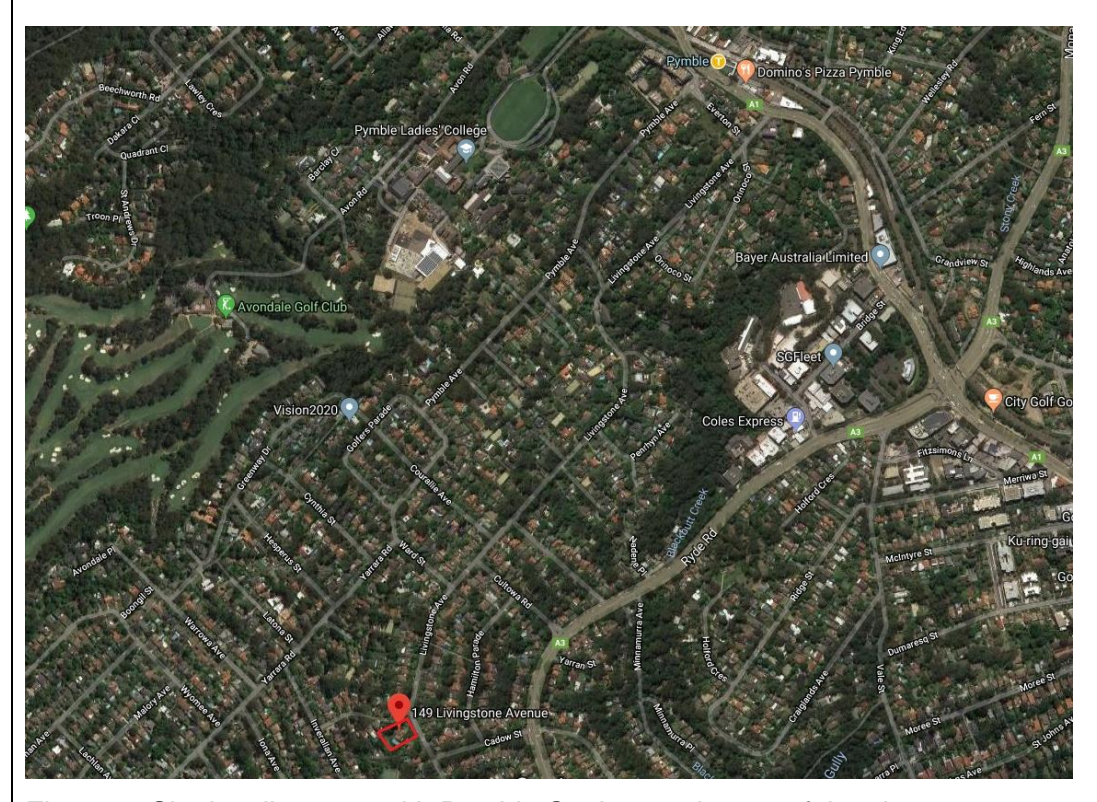
Figure 1: Site locality map, with Pymble Station north-east of the site.

On 20 September 2019, the Council wrote to the Department requesting a review of the Gateway determination decision. This request is now forwarded to the Planning Commission for a recommendation