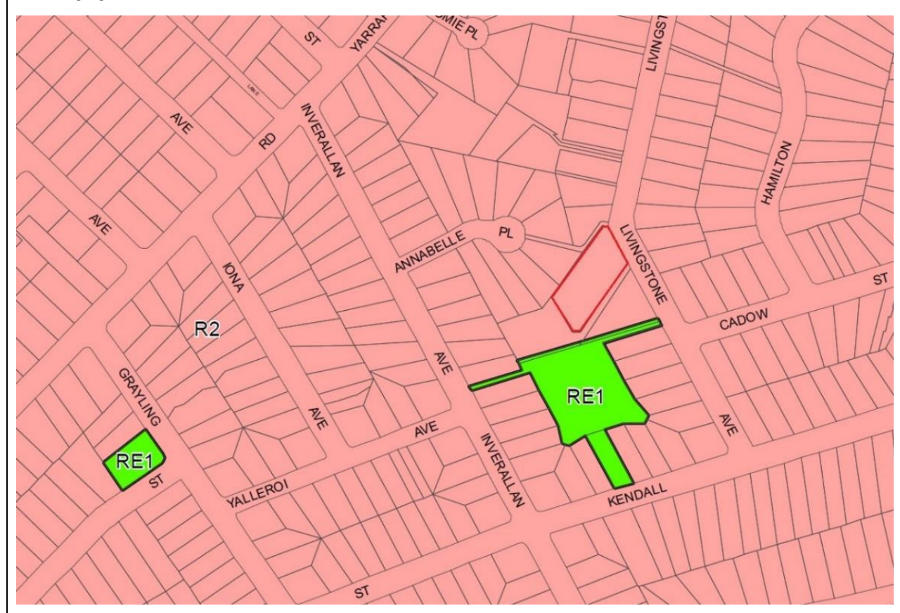
Figure 5: Land zoning map, with the subject site (outlined in red) and surrounding area zoned R2 Low Density Residential (pink) and RE1 Public Recreation (green) to the south and south-west of the site.

This site and surrounding area are zoned R2 Low Density Residential under Ku-Ring-gai LEP 2015.