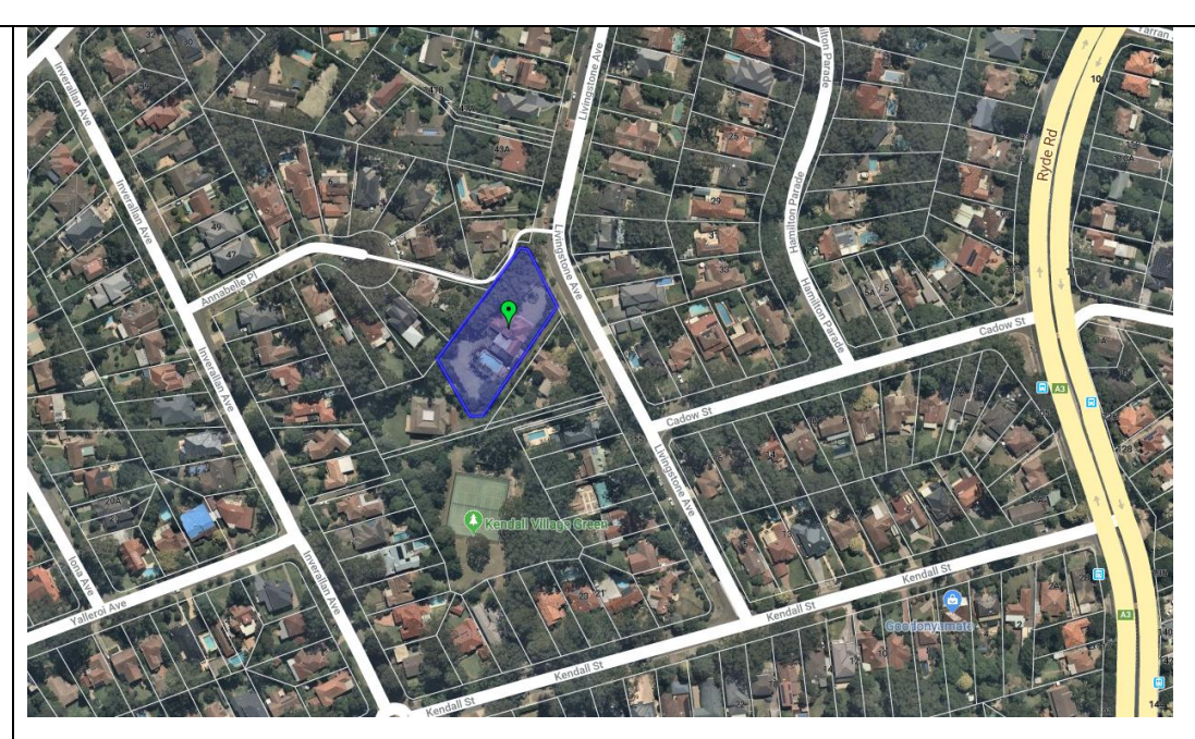
Figure 2: Aerial view of the subject site to be heritage listed.