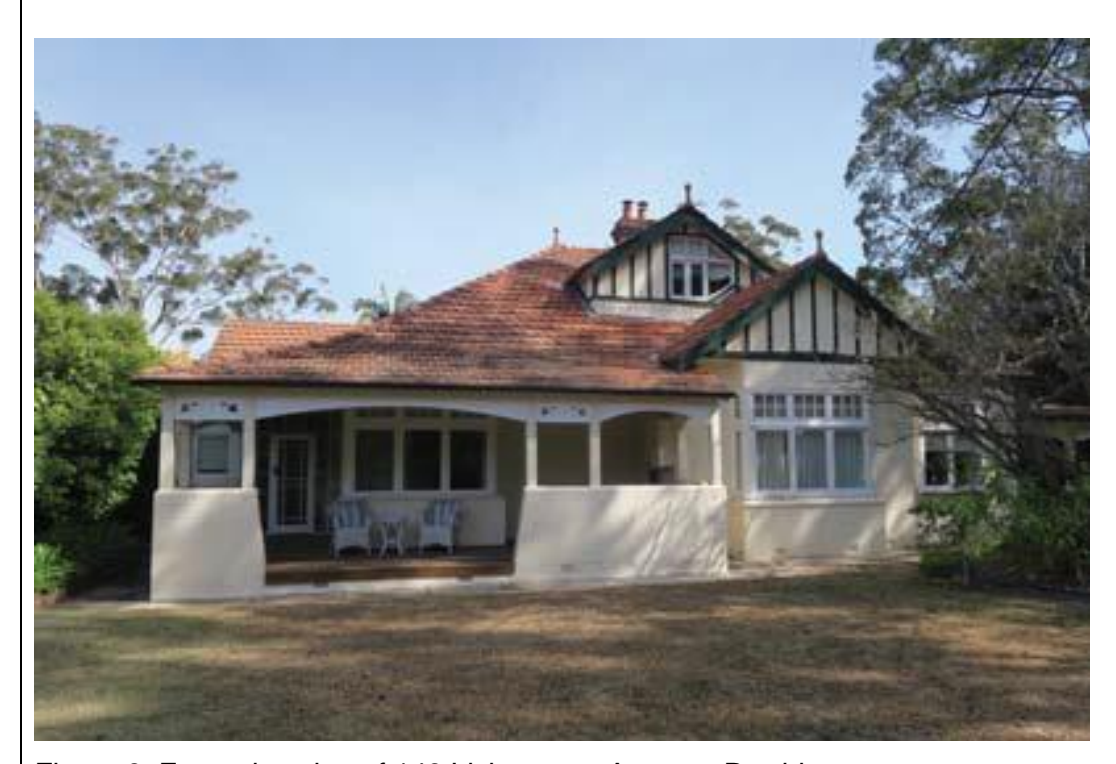
Figure 3: Front elevation of 149 Livingstone Avenue, Pymble