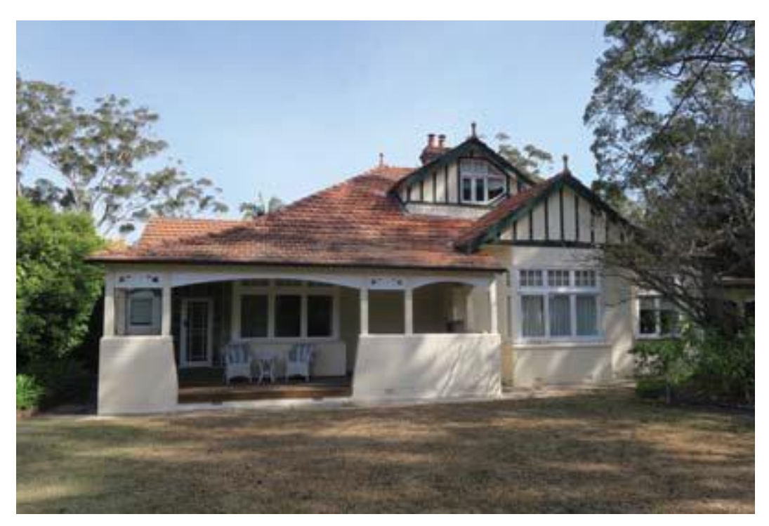
Figure 3: Front elevation of 149 Livingstone Avenue, Pymble.