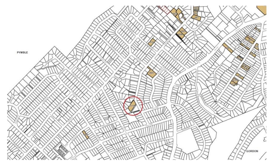
Figure 5: Proposed heritage mapping of subject site (circled in red) affecting 149 Livingstone Avenue, Pymble (Lot 3 DP 607951).