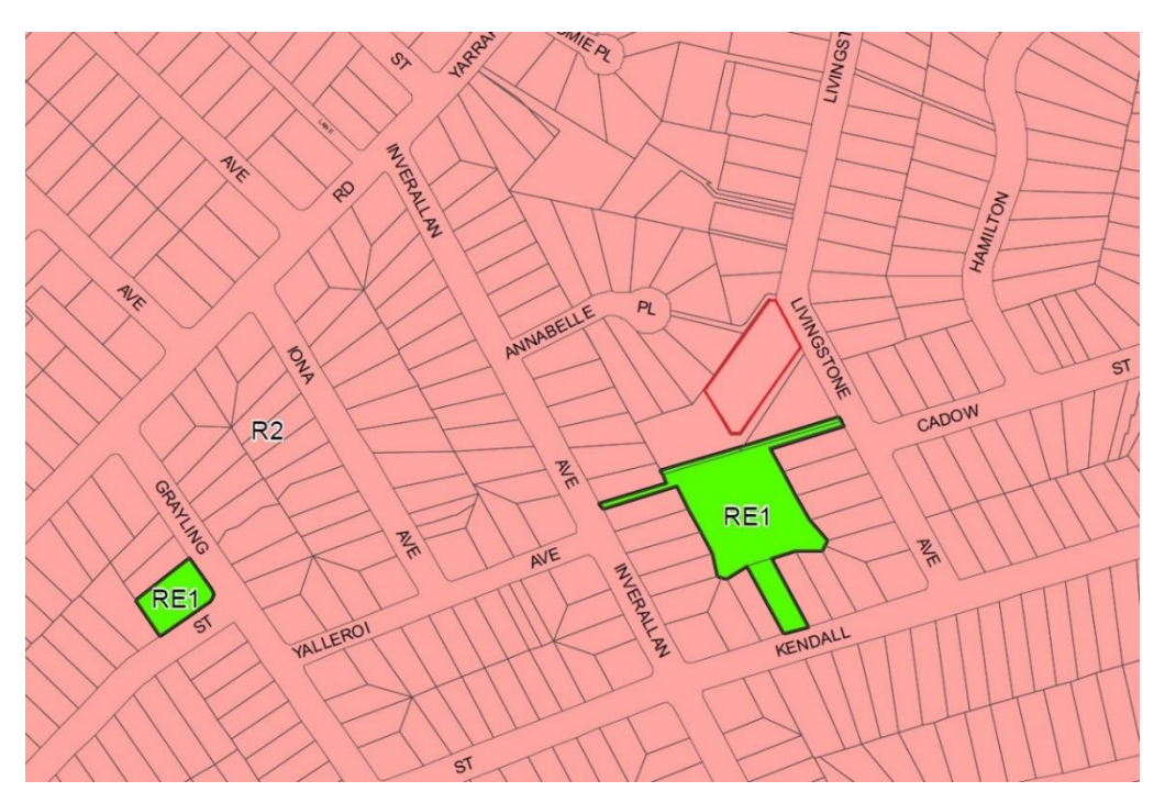
Figure 4: Land zoning map, with the subject site (outlined in red) and surrounding area zoned R2 Low Density Residential (pink) and RE1 Public Recreation (green) to the south and south-west of the site.

The subject site and surrounding area are zoned R2 Low Density Residential under the Ku-ring-gai LEP 2015 (Figure 4).