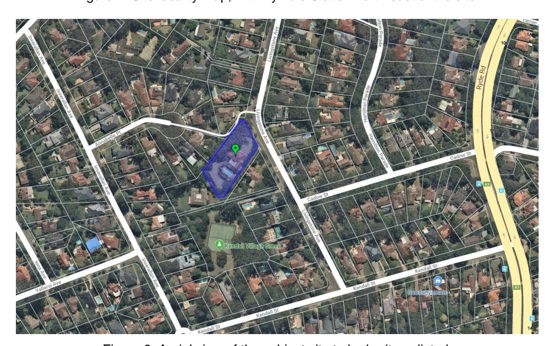
Figure 2: Aerial view of the subject site to be heritage listed.