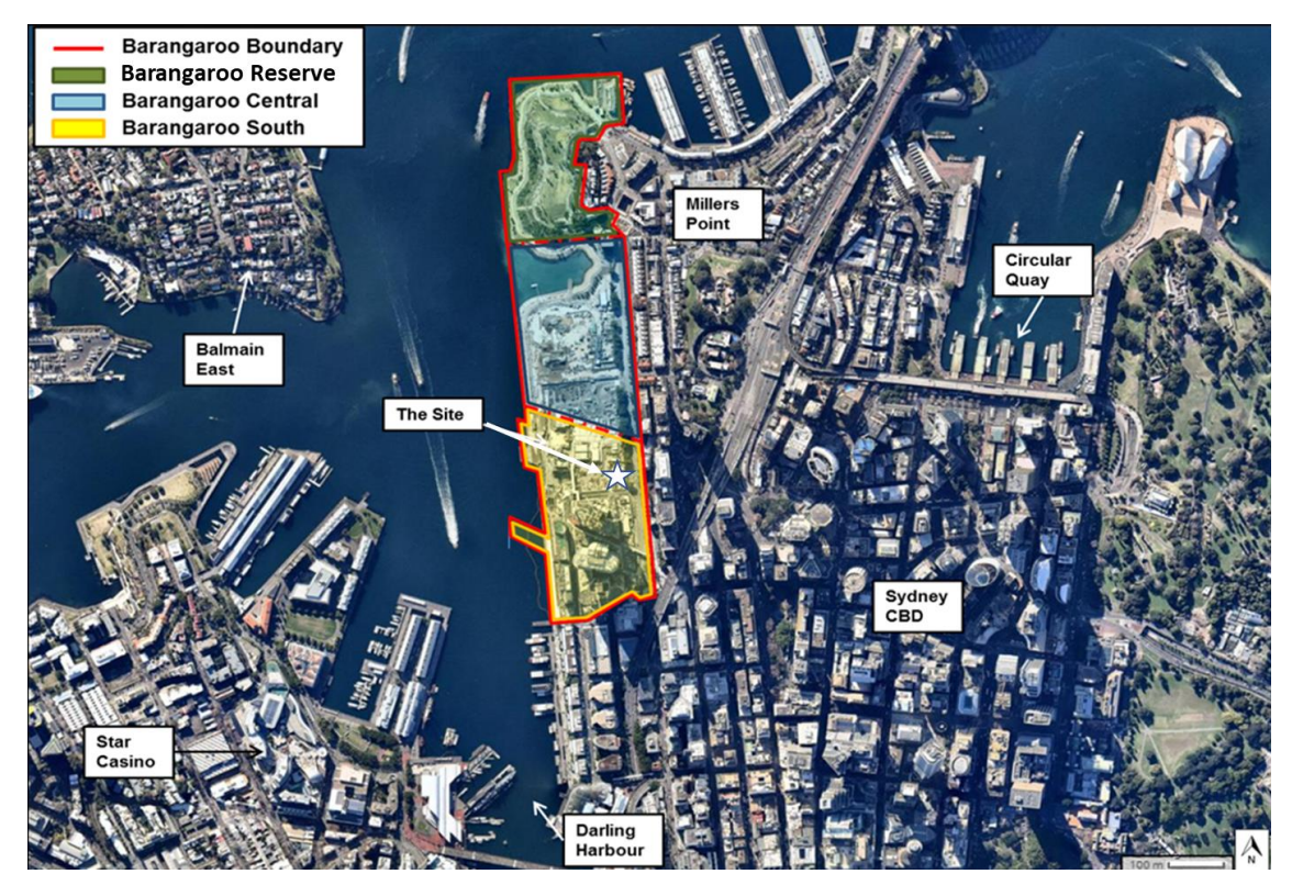
Figure 1 - Barangaroo development precinct

9. The Site is located in the north eastern corner of Barangaroo South and is approximately 1,750 m<sup>2</sup> in size. The Site adjoins Hickson Road to the east, Watermans Quay and Building C1 and International Tower T1 to the south, future residential Buildings R4A and R4B to the west and future Hickson Park to the north ( Figure 2 ).