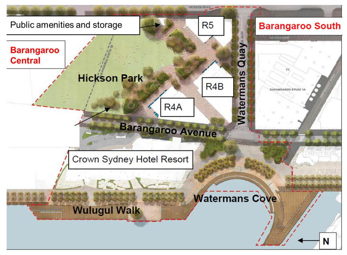
Figure 3 – Overview of the approved Stage 1B Public Domain