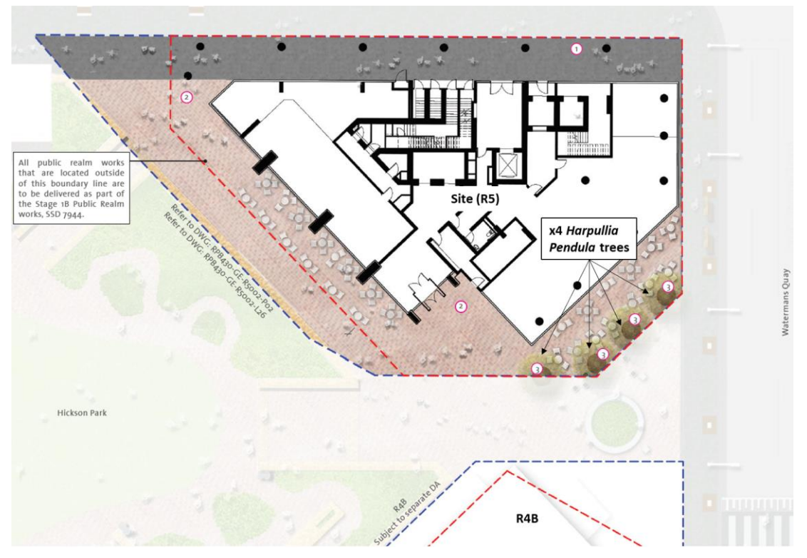
Figure 6 – Ground level public domain and landscaping, including the location of four Harpullia Pendula trees