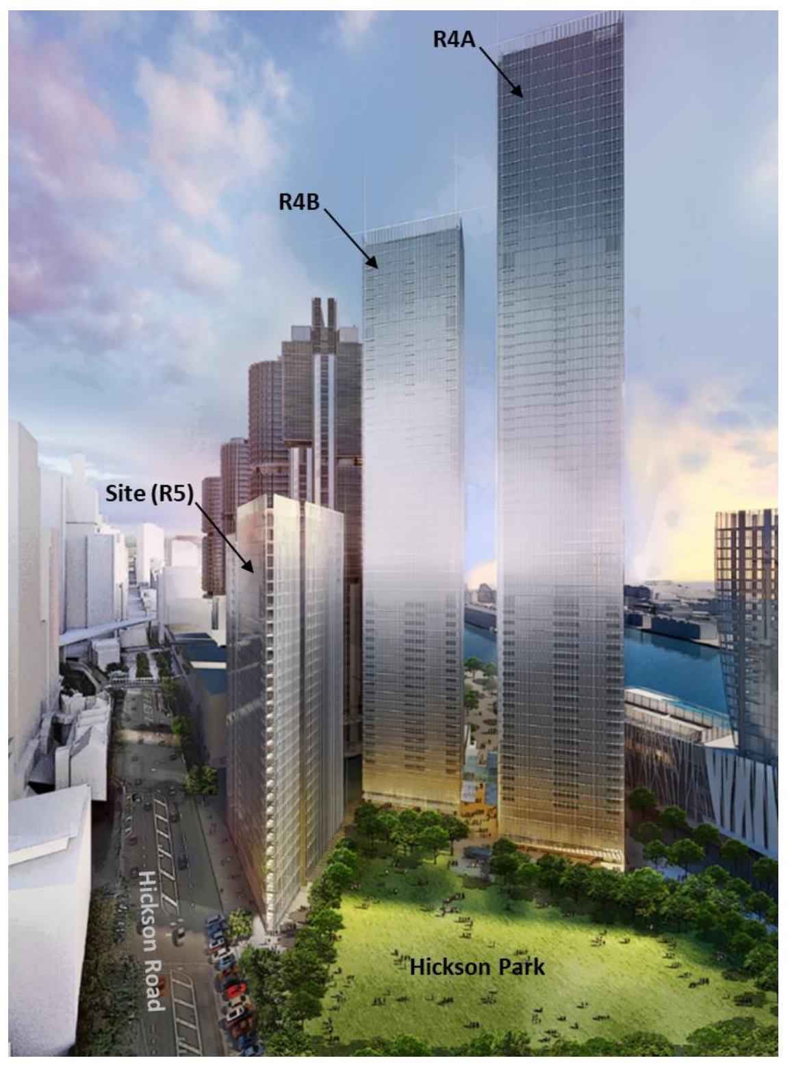
Figure 5 – Perspective view of the tower (looking south) in context with surrounding existing and proposed buildings and spaces