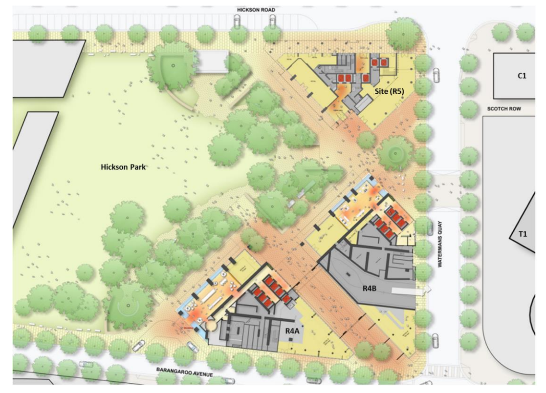
Figure 4 – Ground floor plan of the tower and its relationship to existing and proposed neighbouring buildings and spaces