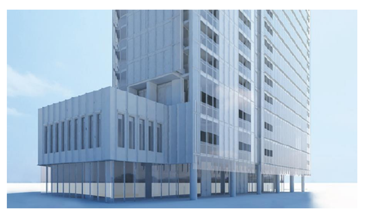
Figure 7 – 3D model showing the the Hickson Road elevation of the tower, including the part podium and shear form of the elevation and ground floor colonnade