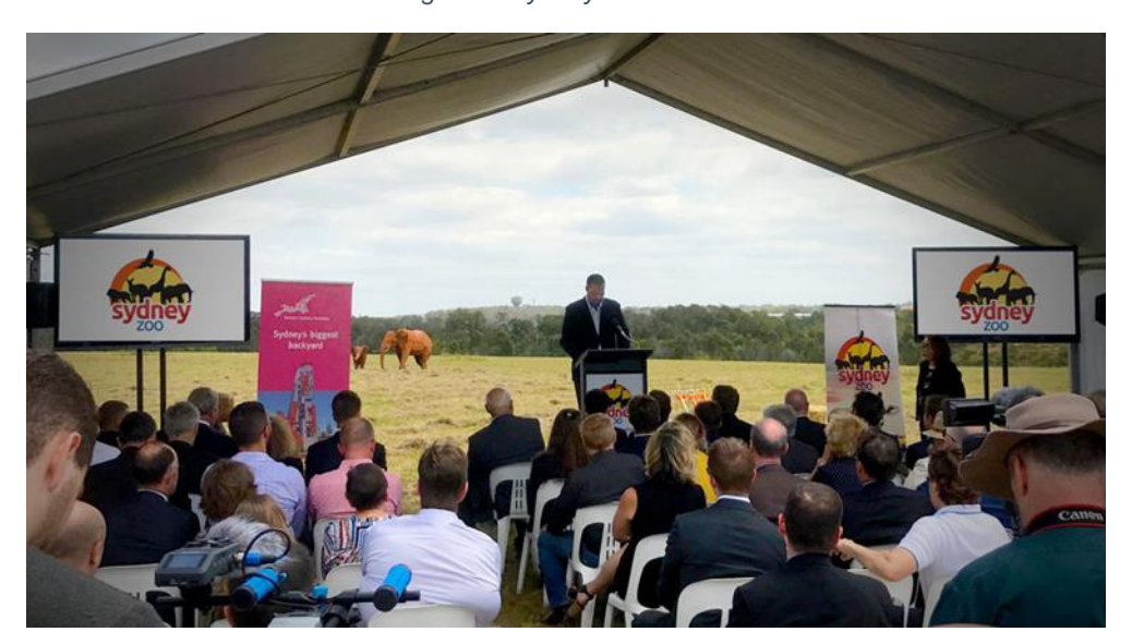
Figure 4: Sydney Zoo launch