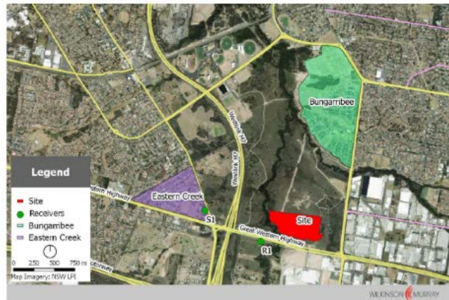
Figure 2-2 Sensitive Receivers