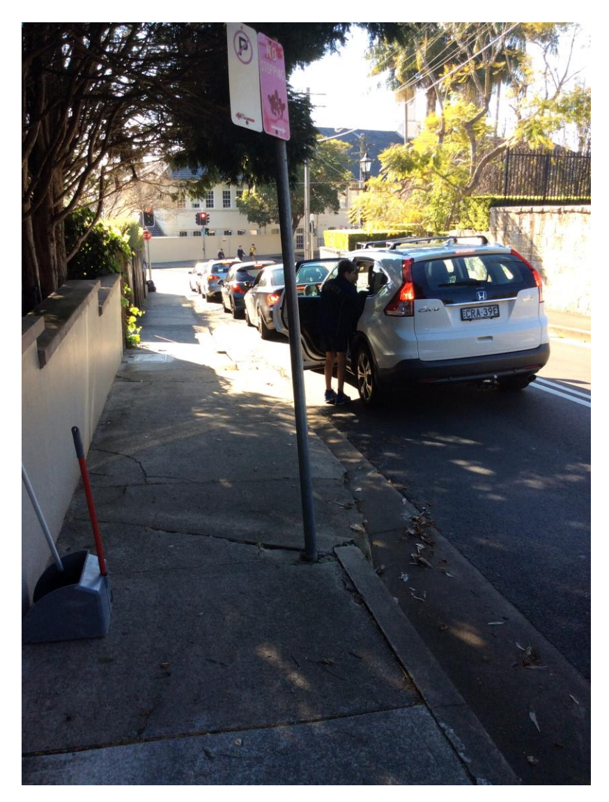
Ginagullah Rd dropping off at traffic light