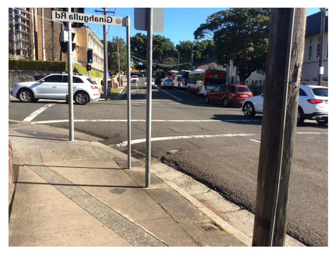
Table 4 Cranbrook Rd towards Cranbrook Lane, figure 7

Table 3 Victoria Rd southward towards Cranbrook Rd, figure 6