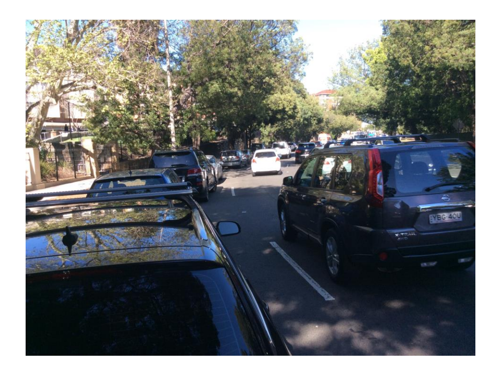
Table 3 Victoria Rd southward towards Cranbrook Rd, figure 6

Table 2 New South Head Rd Westbound towards Victoria Rd, figure 5