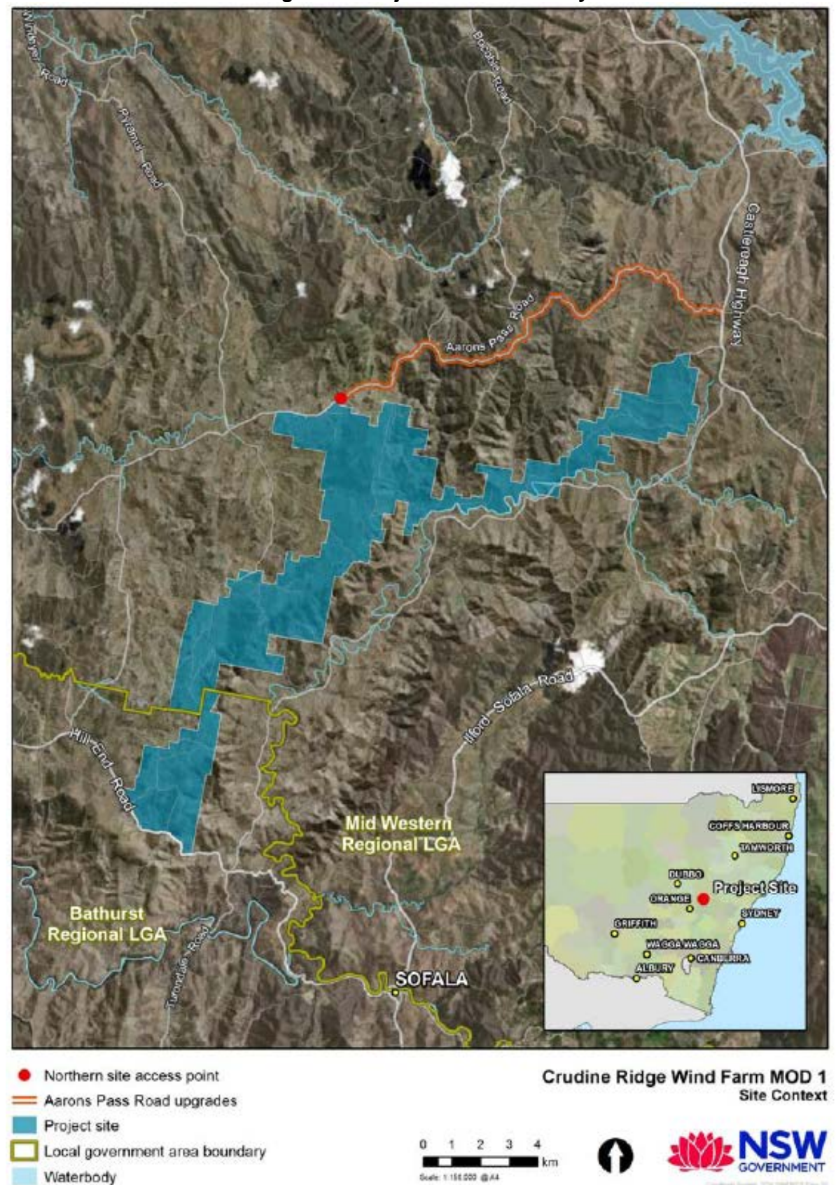
Figure 1 – Project Site and Locality