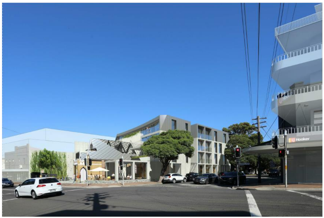
Photomontage – view of proposed development from intersection of Old South Head Road and Dover Road