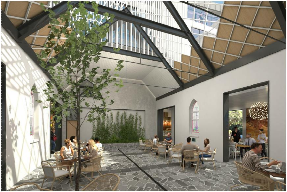
Photomontage - reuse of 1905 section of church