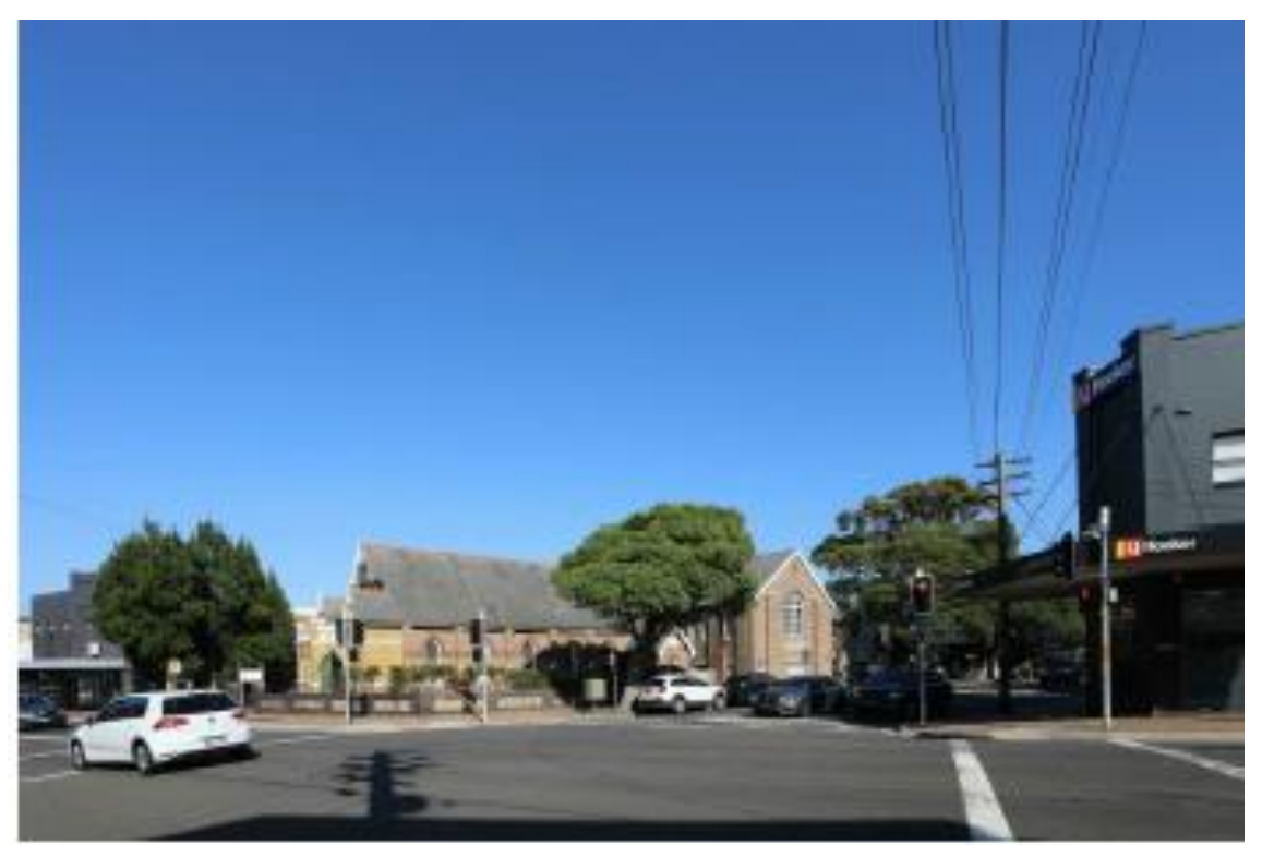
Existing view from intersection of Old South Head Road and Dover Road