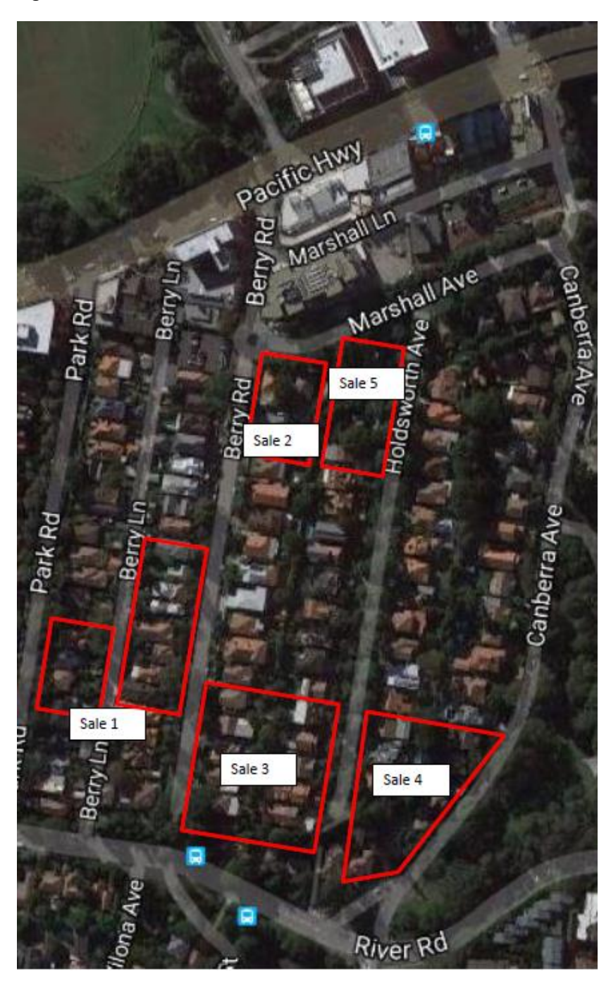
Figure 2: St Leonards South Precinct

The analysis of each sale follows the map below.