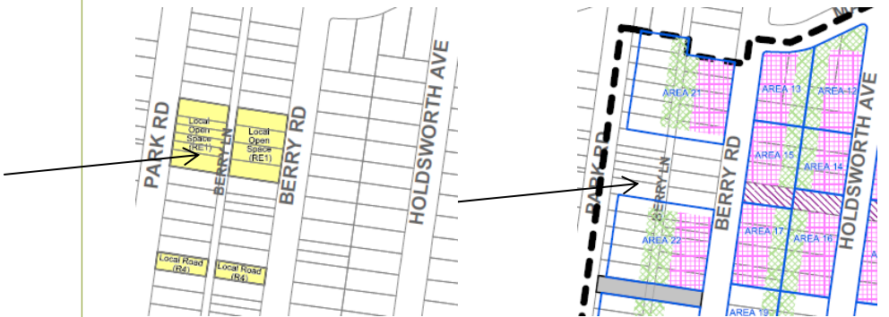
Figure 1: Land Reservation Acquisition map (left) and Special Provisions Area map (right)

Our discussions with Council have confirmed that the land to the north and south of the designated Open Space area is to have an incentive FSR of 2.75:1. The planned LEP will only permit this incentive FSR if both the preferred site amalgamation and compliance with the Landscape Master Plan occurs on the site".