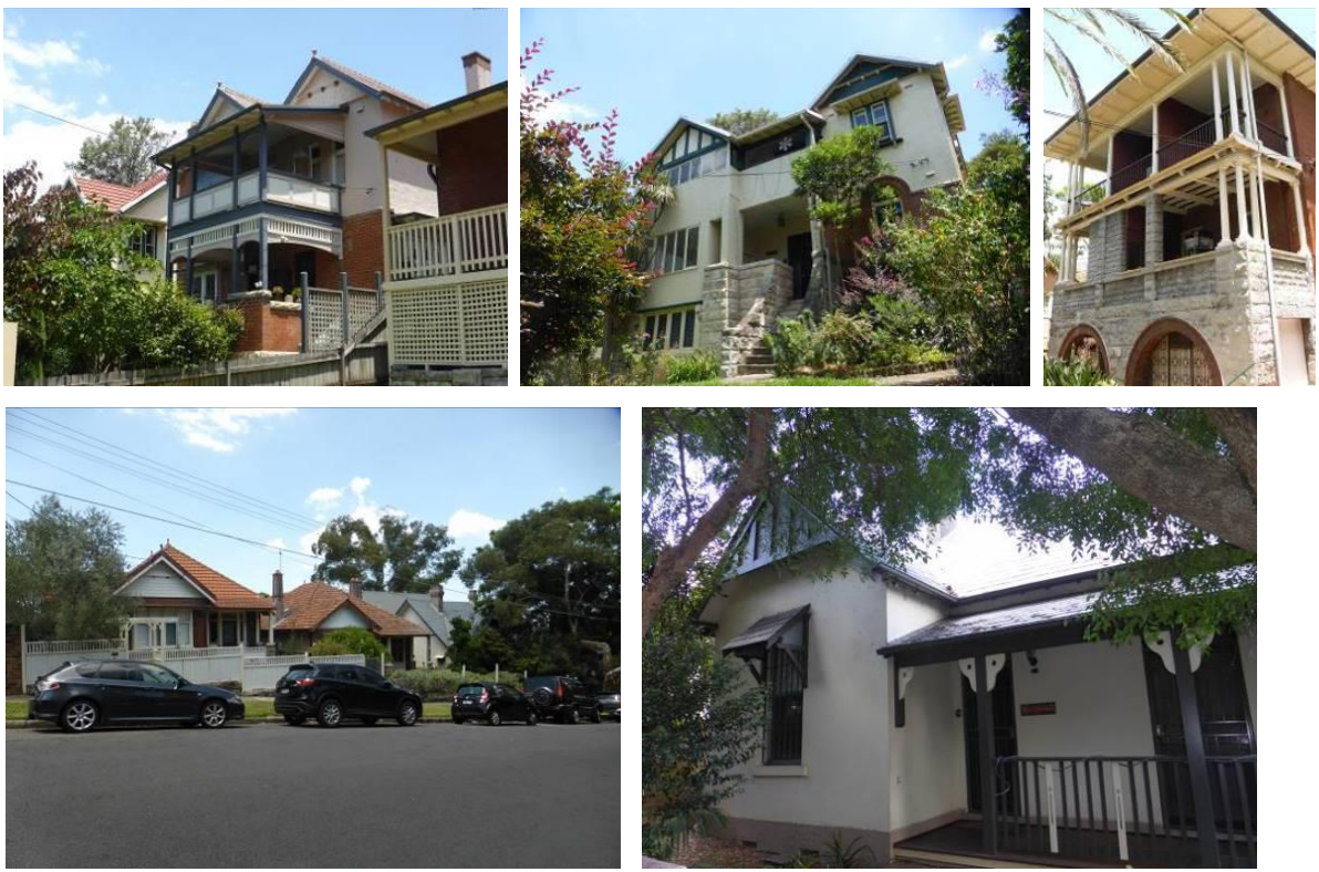
12, 14 and 16 Park Road