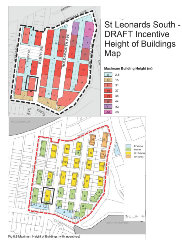
Figure 4: Developer-contested height limit, subject area outlined in black (adapted from proposal LEP and DCP plans)

Road, Berry Road and River Road, and so is relevant to overshadowing and transition to low density in the south western section of the proposal area. This discrepancy is evident from comparison of the LEP building height diagram and the DCP building heights (refer Figure 4). The impact of this revised 37 metre building height (if correct) should be assessed in shadow modelling, particularly affecting the south side of River Road.