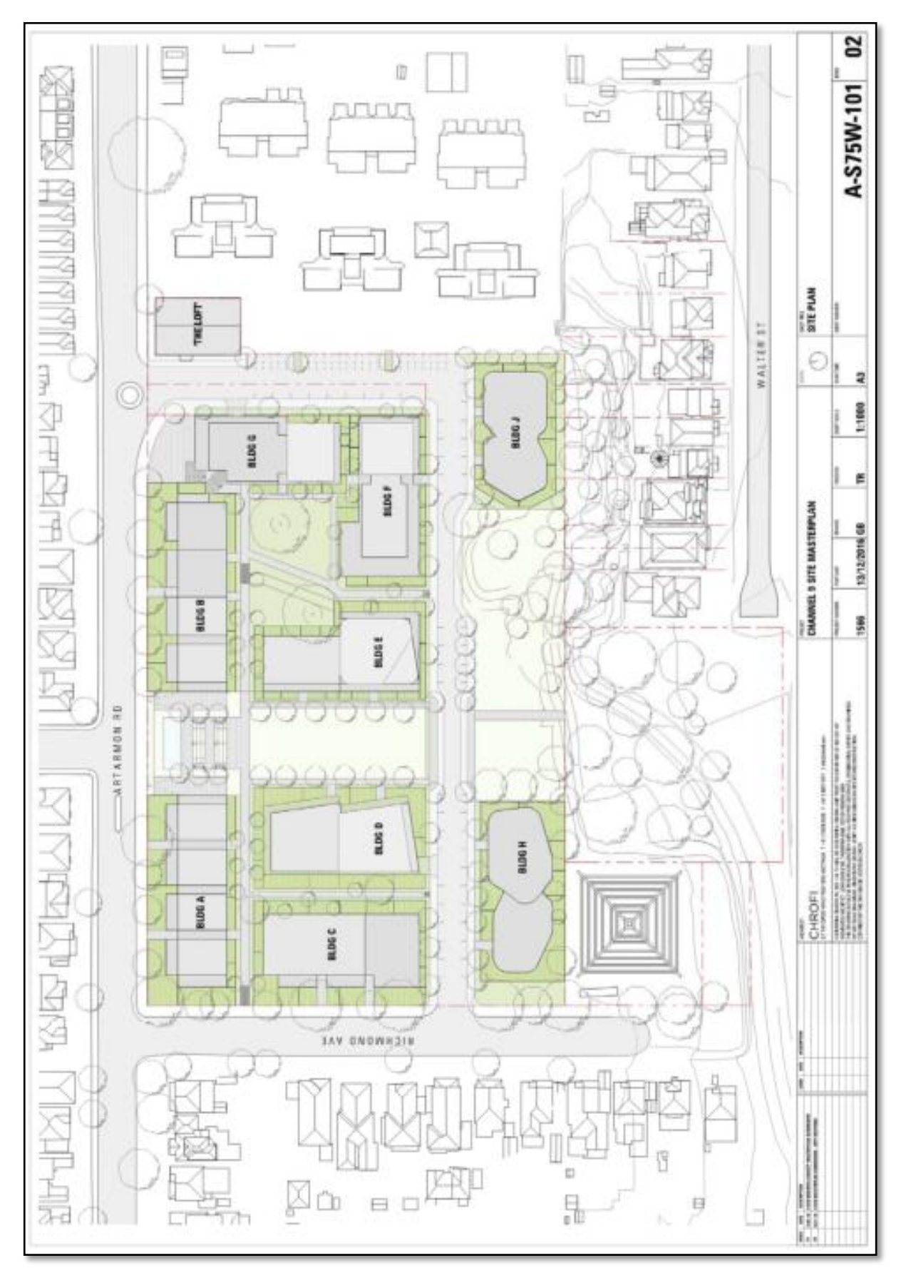
Figure 2: Development Site Layout