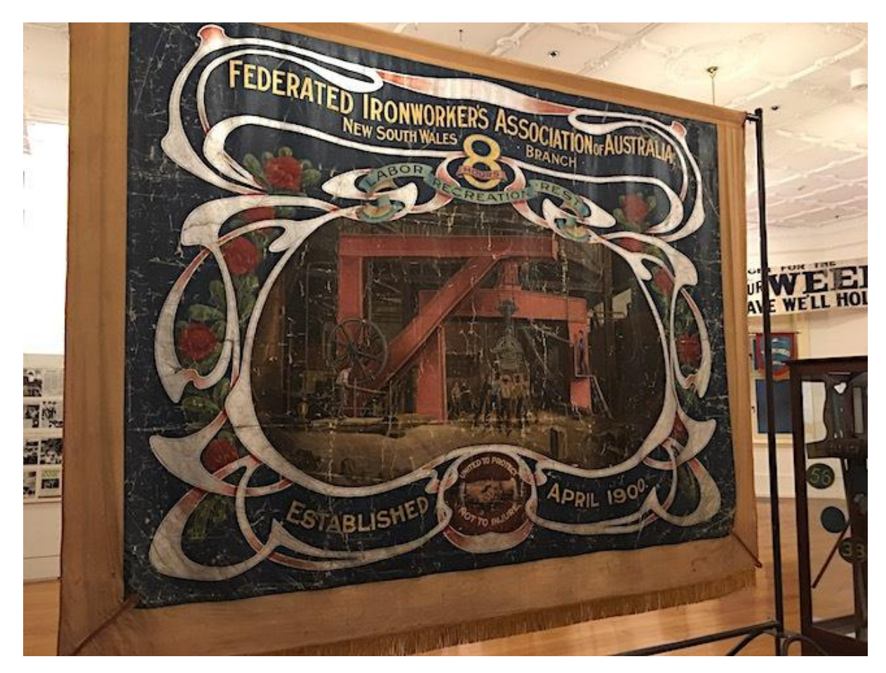
(Ironworkers banner from early 1900s depicting the scale of the work that Eveleigh workers performed

The national significance of the moveable heritage at Sydney Trades hall is well recognised, as pointed out above. This connects directly with the significance of the heritage machinery, buildings and tools that remain at Eveleigh. The era of Australian history that the age of banner making and the age of rapid industrial development in the new nation of Australia are captured well by both these collections. Just as the significance of the Trades Hall's collection is intimately tied to the size and number of items that remain together at the Hall, so to the significance of the Eveleigh workshops is vastly enhanced by the fact that they do remain.