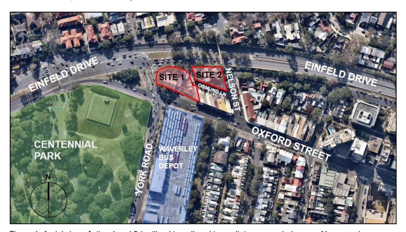
Figure 1: Aerial view of sites 1 and 2 (outlined in red) and immediate surrounds.

The site includes heritage items, specifically a row of terraces along Oxford Street and a Norfolk Island pine tree along Nelson Street.