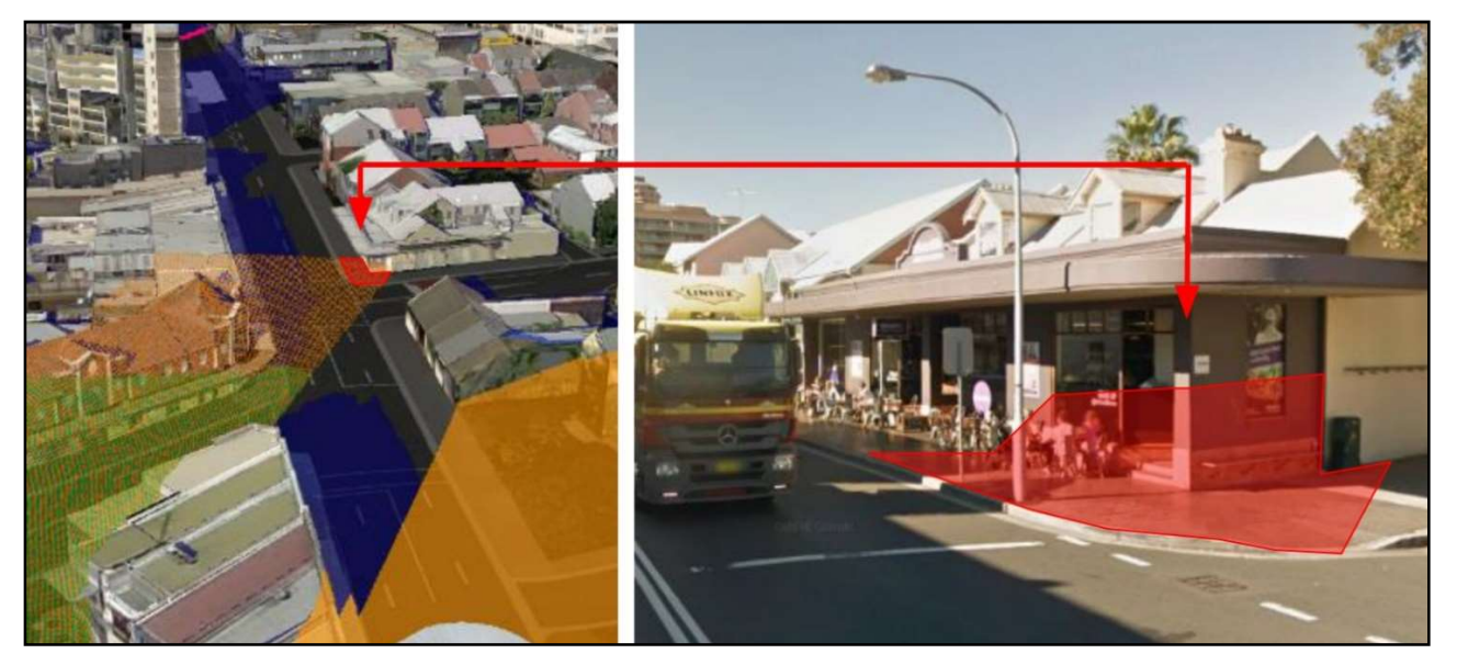
Figure 4: Overshadowing of public domain space at 3pm on 21 June (midwinter).