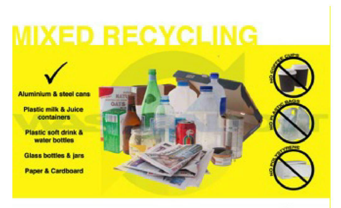
Don't waste YOUR future