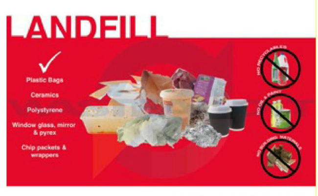
Don't waste YOUR future