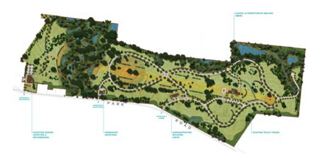
Figure 1 - Site Masterplan

Waste audit and management strategies are recommended for new developments to provide support for the building design and promote strong sustainability outcomes for the building. All recommended waste management plans will comply with council codes and any statutory requirements.