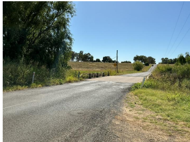
Figure 4 – view of the existing Whitehouse Lane road bridge