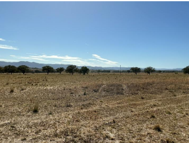
Figure 3 – view of the proposed location of the main Kingswood BESS infrastructure, looking south east