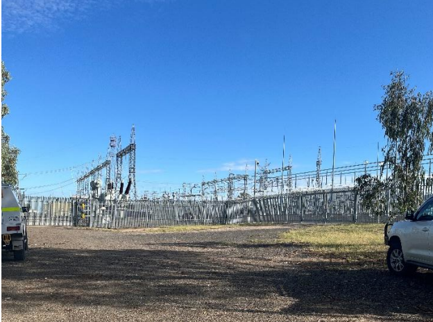
Figure 1 – view of Tamworth Substation