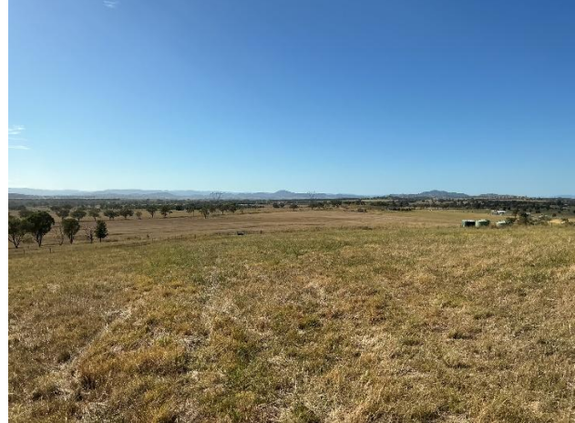
Figure 2 – view to the proposed location of the main Kingswood BESS infrastructure, looking south east (taken from vantage point on site)