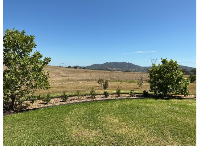
Figure B – view of the site from Lot 1 DP632414, looking north