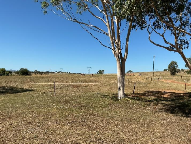
Figure A – view of the site from Lot 2 DP244399, looking south