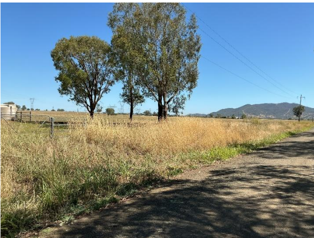
Figure C – view of the south-eastern corner of the from Ascot-Calala Road, looking north-west