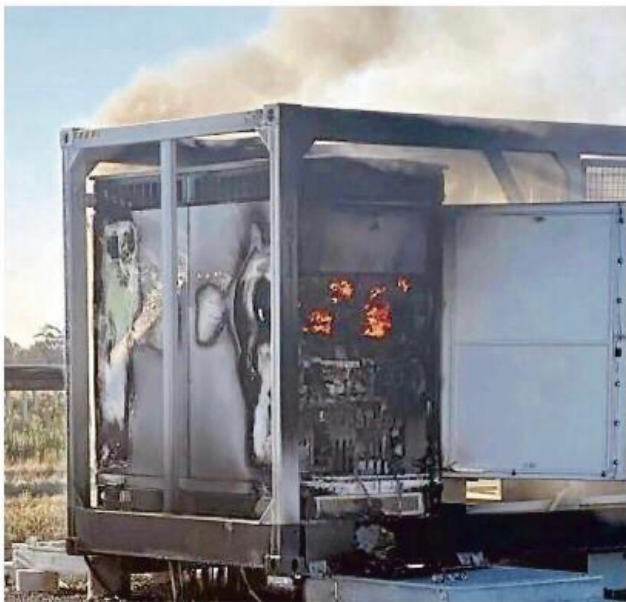
A transformer at a central Victorian solar farm caught fire late on Thursday.