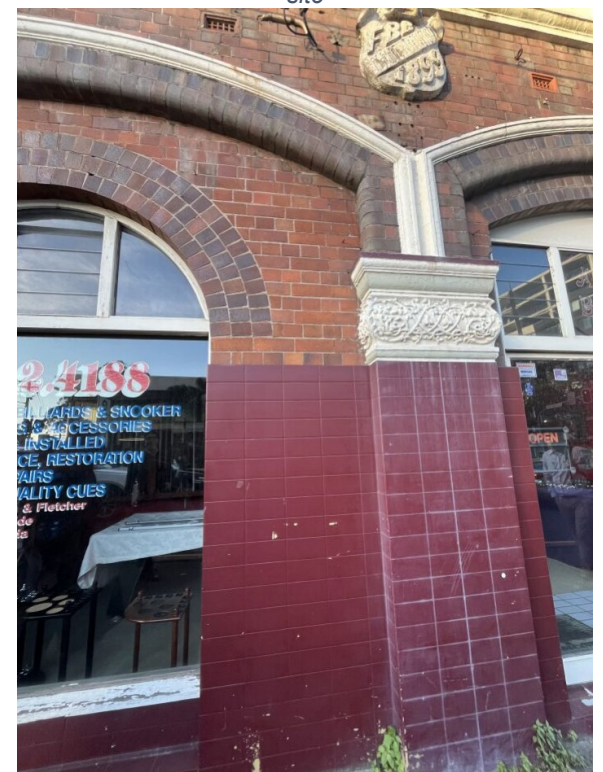
Figure 1 – Façade of the 'old fire station' existing on the site