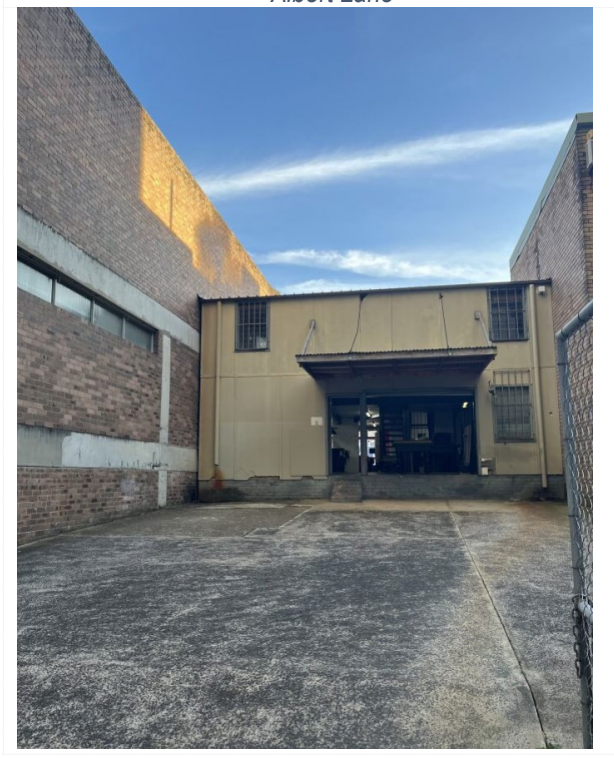
Figure 5 – Looking west to the rear of 'old fire station' from Albert Lane

New South Wales Government Independent Planning Commission