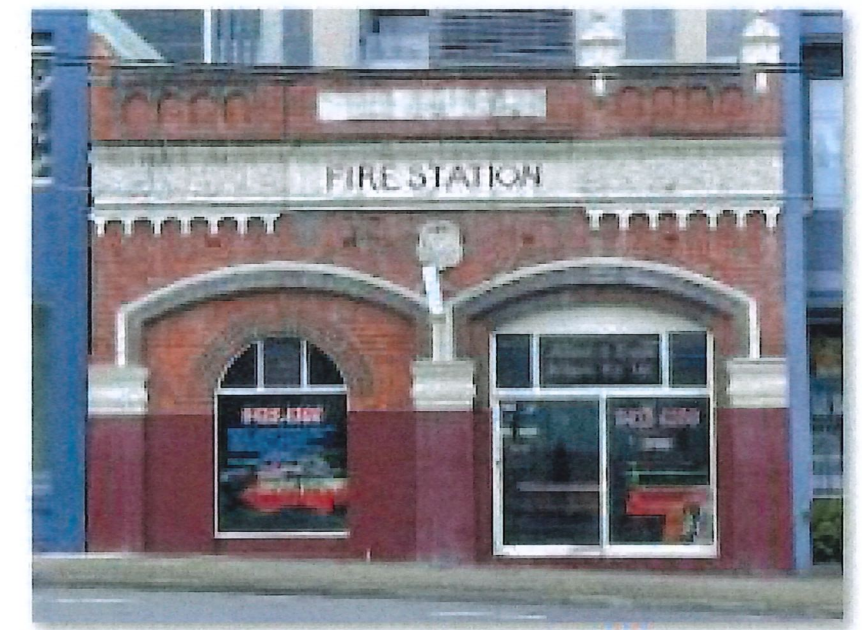
Former Fire Station 2024