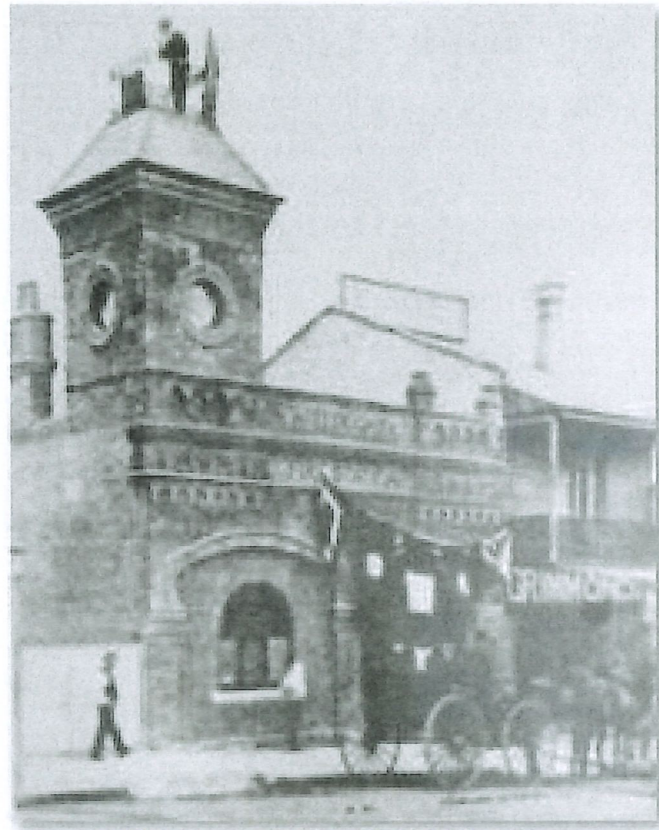
Former Fire Station 1900a