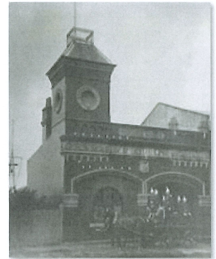
Former Fire Station 1910