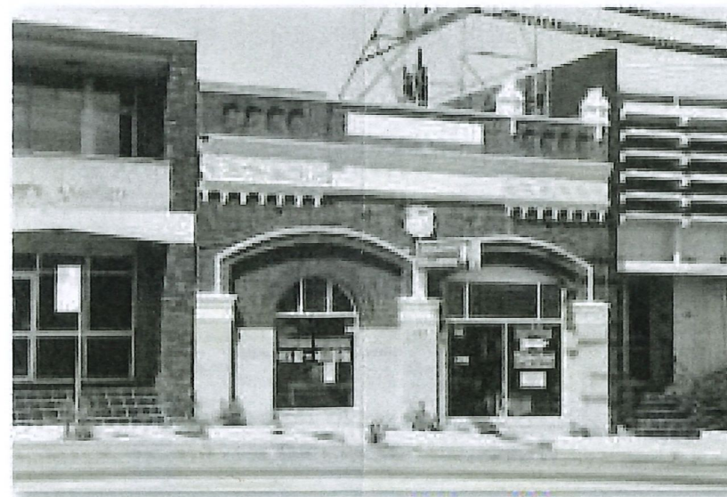
Former Fire Station 1986