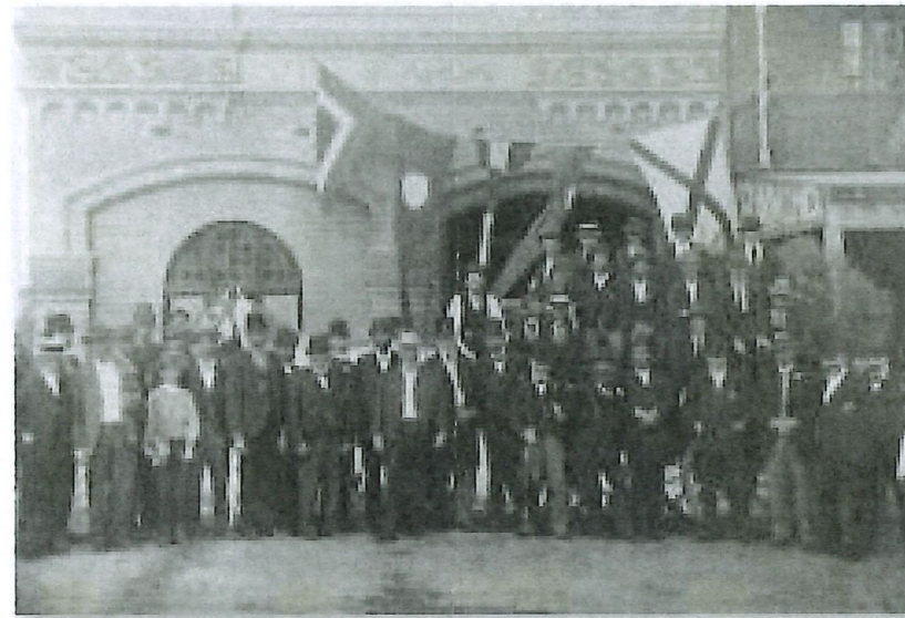
Former Fire Station 1900b