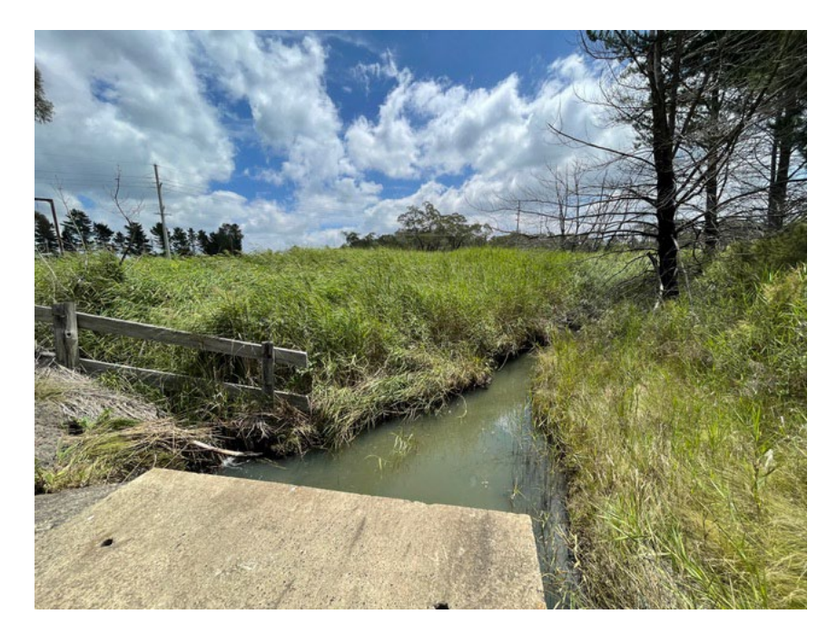
Image 2 – Wangcol Creek in vicinity of LDP001 (looking downstream)

Image 1 – Wangcol Creek in vicinity of LDP001 (looking upstream)