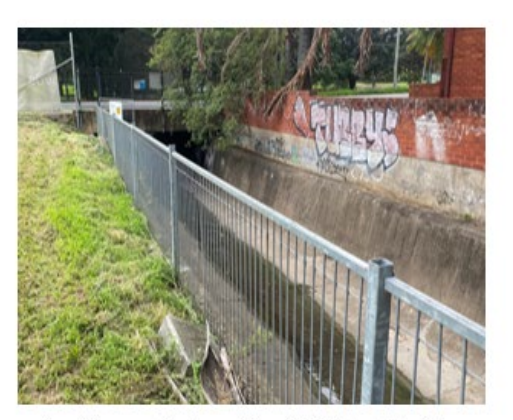
Looking east along Clay Cliff Creek to the Harris Street bridge

Clay Cliff Creek bordering the south of the Site