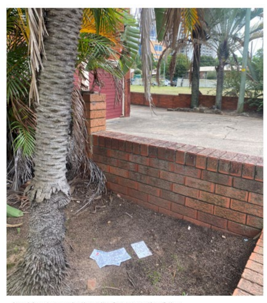
Looking towards the site from south of the site on Harris Street