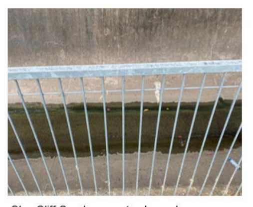
Clay Cliff Creek concrete channel