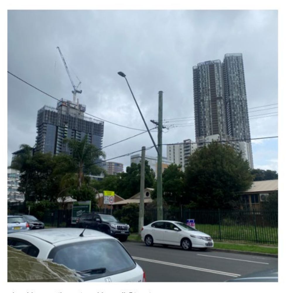
Looking northwest on Hassall Street