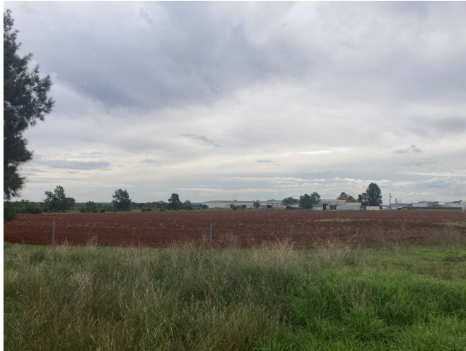
Looking northwards into project site