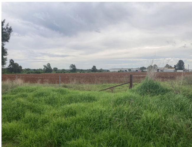
Looking towards approximate centre of site and locations of proposed gas storage pipeline and gas power generation fuel storage