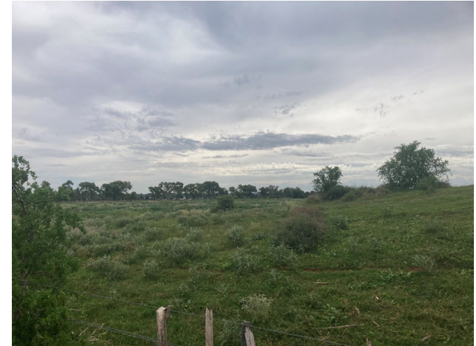
Standing adjacent to south-west corner of site, looking towards north-west and neighbouring land uses