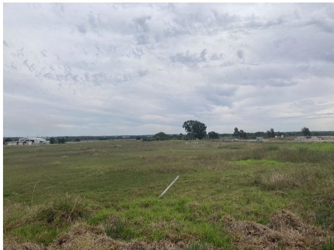
Land within easement and along southern boundary of site, looking south-west