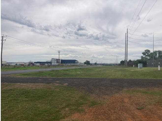
Yarrandale Road, looking north towards neighbouring land uses

In-front of Essential Energy Electricity Substation, Yarrandale Road, Dubbo