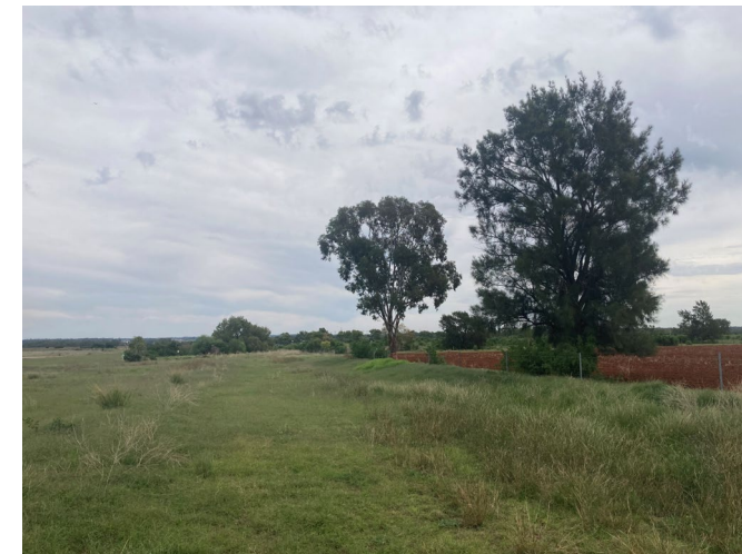
Land within easement and along southern boundary of site, looking west