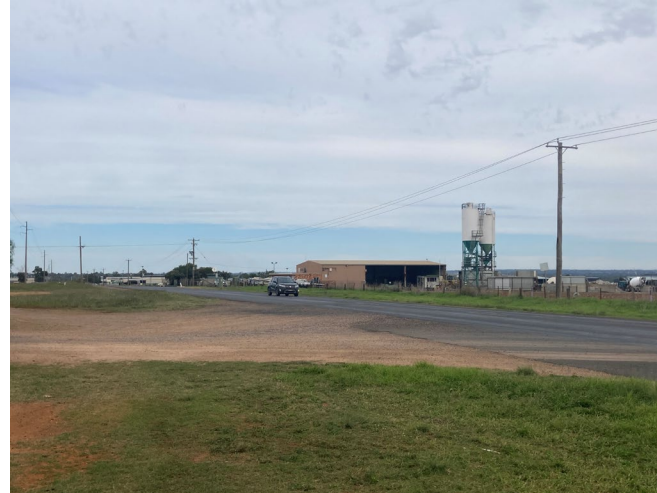
Yarrandale Road, looking south towards neighbouring land uses