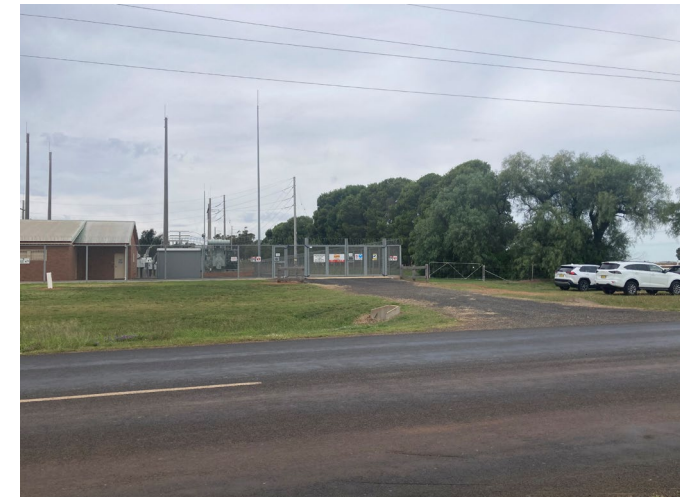
Essential Energy Electricity Substation, looking east