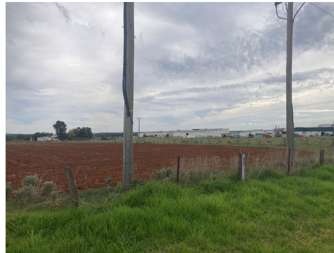
Looking towards approximate location of proposed project substation from road reserve, with neighbouring land uses in background