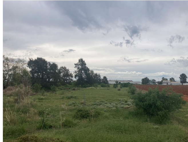
Looking towards approximate locations of proposed water tanks