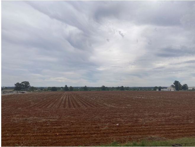
Looking west into project site from road reserve adjacent to Yarrandale Road