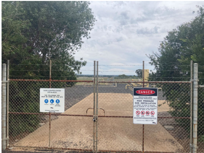
Dubbo Scrapper Station, looking west (proposed gas connection pipeline location in far background)