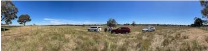
Image 4 – View of inundation area from the locality of the proposed substation