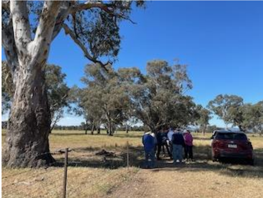
Image 11 – View looking north-east along the north-eastern boundary of the site