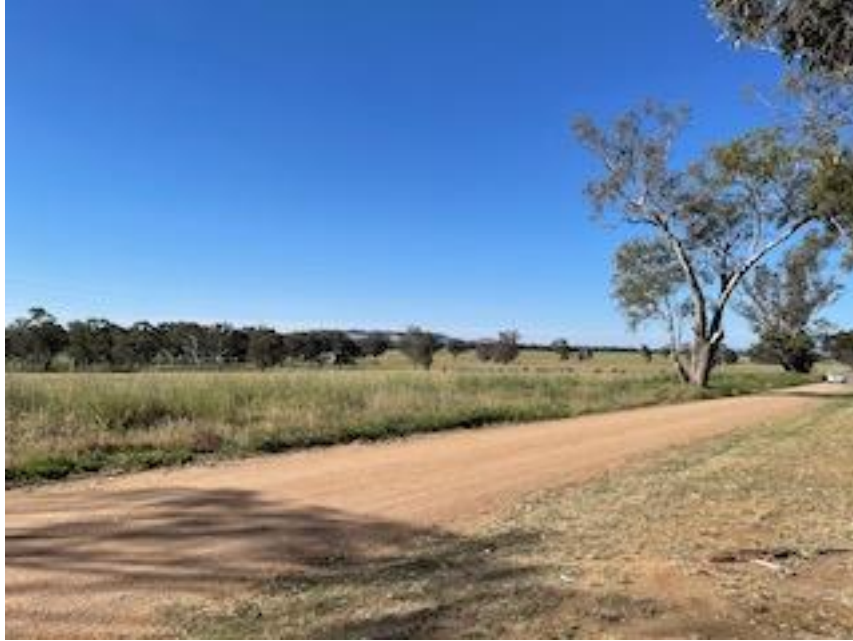
Image 16 – View looking north-east from the front boundary of receiver at 234 Drumwood Road across the south-western corner boundary of the proposed PV array