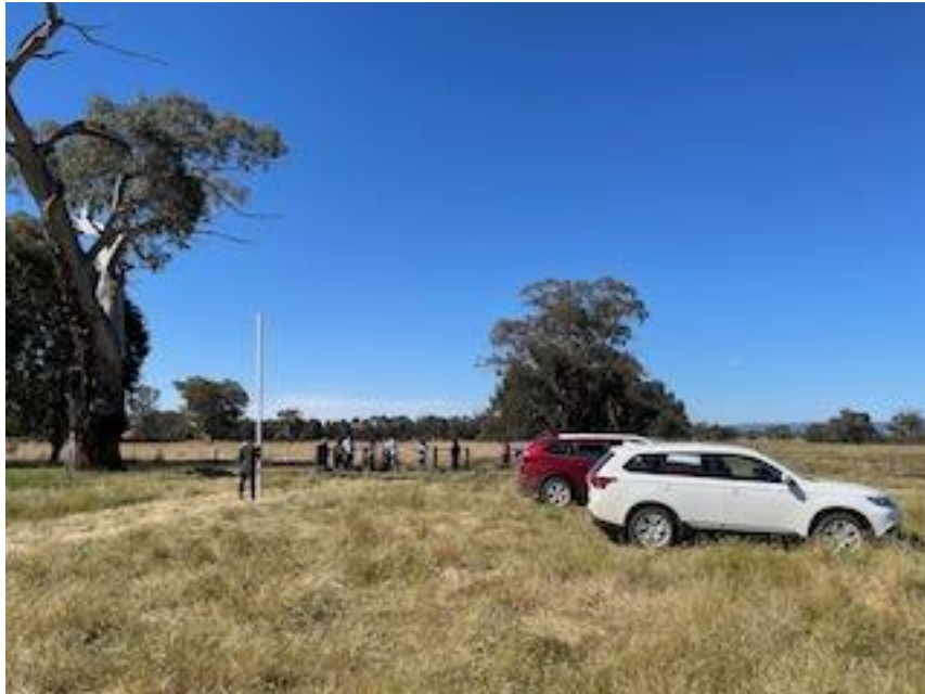
Image 15 – View looking north-east towards the north-eastern corner boundary of the site with the unpaved section of Blight Road – height pole (white) shows maximum height of the arrays