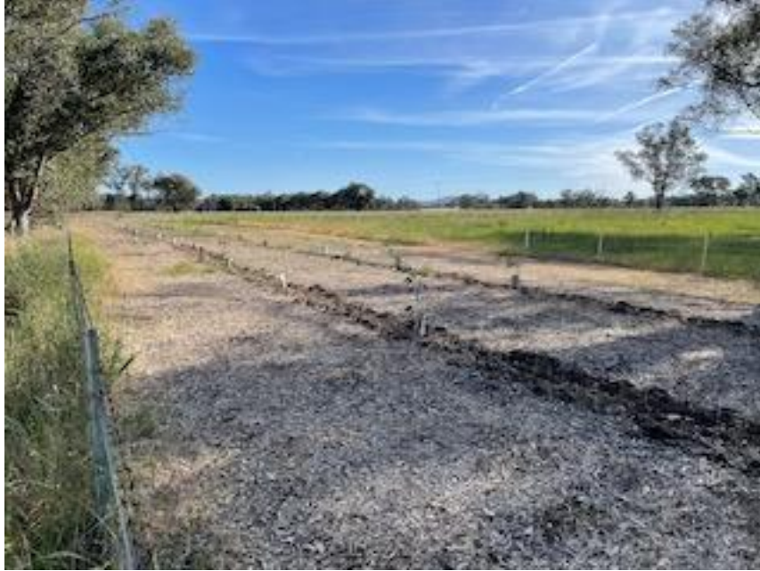
Image 18 – Screening plantings for the Jindera Solar Farm along its boundary with Ortlipp Road