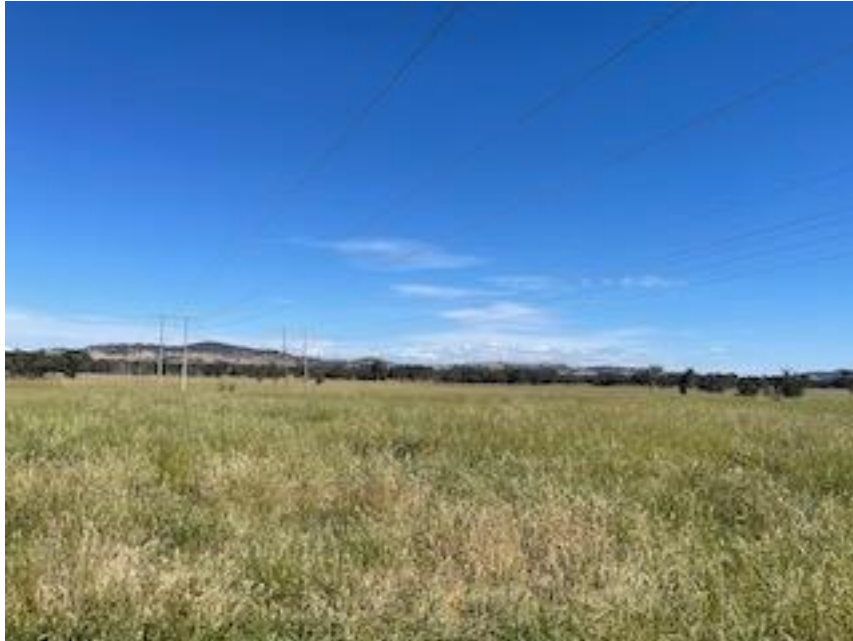
Image 10 – Looking north-west towards the existing substation from its south-eastern boundary