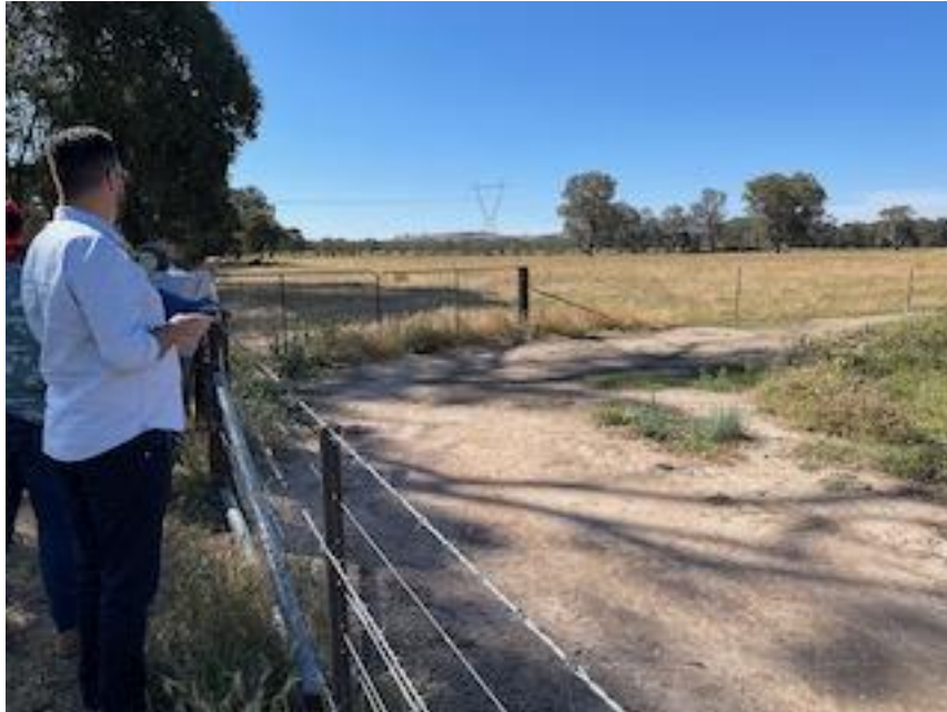
Image 13 – View looking north-east towards the north-eastern corner boundary of the site with the unpaved section of Blight Road – height pole (white) shows maximum height of the arrays