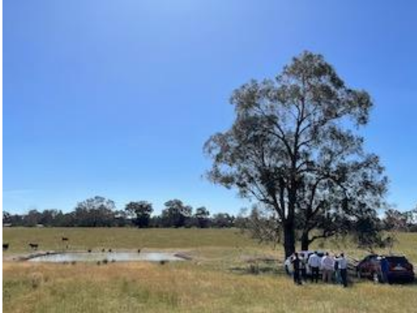
Image 5 – View looking south-west towards the corner of Lindner Road and Ortlipp Road from the southern boundary of the proposed PV array