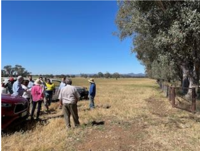
Image 7 – View looking south-east from the south-eastern corner of the proposed PV array