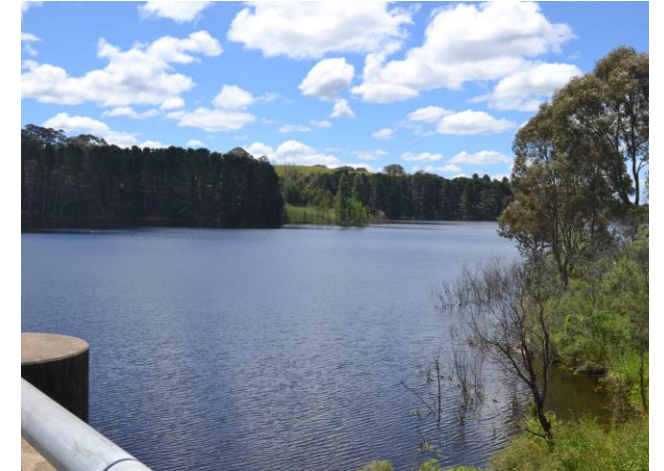
View of Carcoar Lake from Carcoar Dam Road, looking north-east