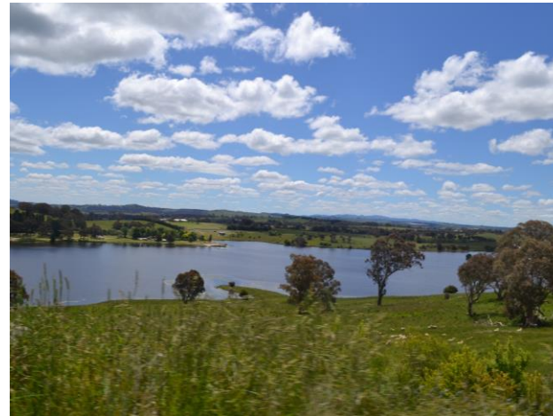
View of Carcoar Lake from Carcoar Dam Road, looking west