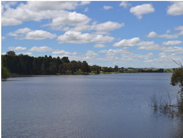
View of Carcoar Lake from Carcoar Dam Road, looking north