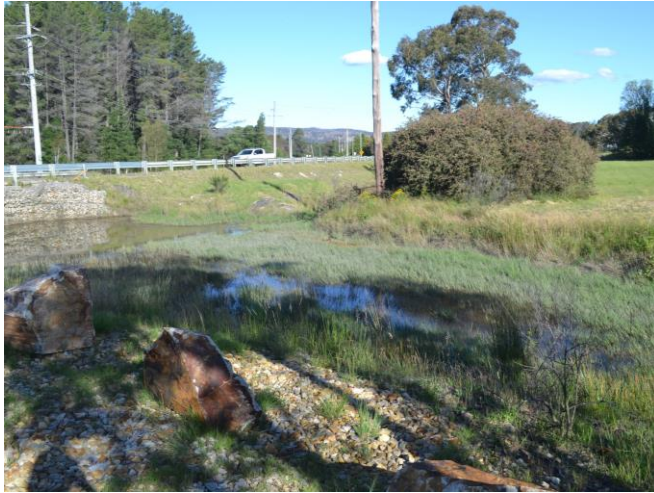
View of existing pumping station and associated retention pond adjacent to gateway to Springvale Coal Services, looking north-west towards Castlereagh Highway.

The Panel viewed the location of the second pumping station facility for the project water supply pipeline at the gateway to Centennial Coal's Springvale Coal Services in Blackmans Flat.