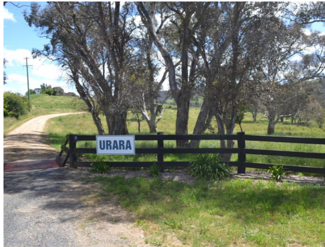
View of Urara gateway off shoulder of Mid Western Highway, looking south-west.

The Panel viewed the location (at the gateway of 'Urara' at Mid Western Highway, Bathampton) of the proposed water supply pipeline road crossing of the Mid Western Highway.