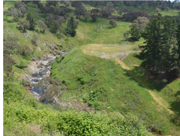
View of Belubula River from Carcoar Dam, looking south-west