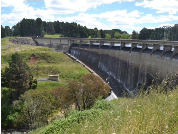
View of Carcoar Dam from Carcoar Dam Road, looking west

The Panel travelled around Carcoar Lake, passing Carcoar Dam, the Belubula River and Carcoar Freecamp and Windfarm.