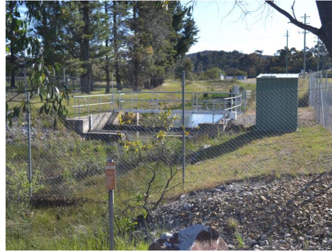
View of existing pumping station adjacent to gateway to Springvale Coal Services, looking west.