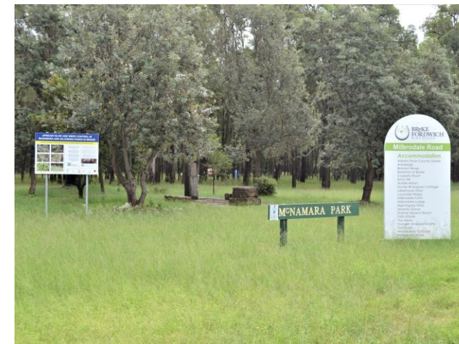
View of McNamara Park from the corner of Wollombi Street and Milbrodale Road looking north-west.