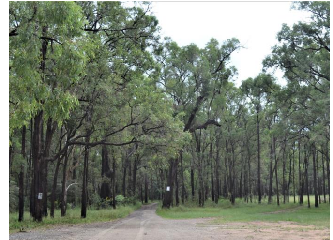
View of camping area access road from McNamara Park looking north-west.