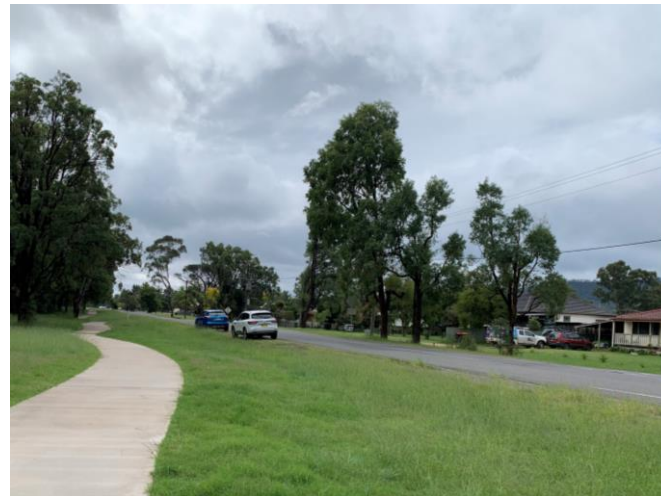
View of Wollombi Street with Broke beyond from McNamara Park. View looking north.