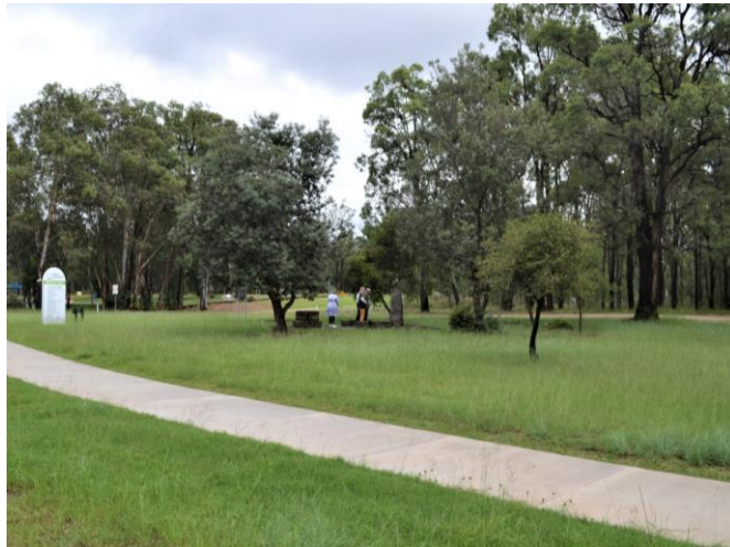
View of McNamara Park from Wollombi Street looking south-west towards Wollombi Brook.