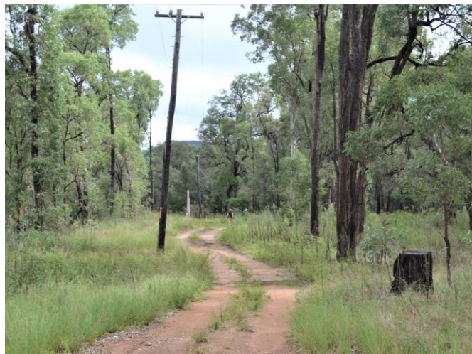
View looking west towards Wollombi Brook from McNamara Park along access road.