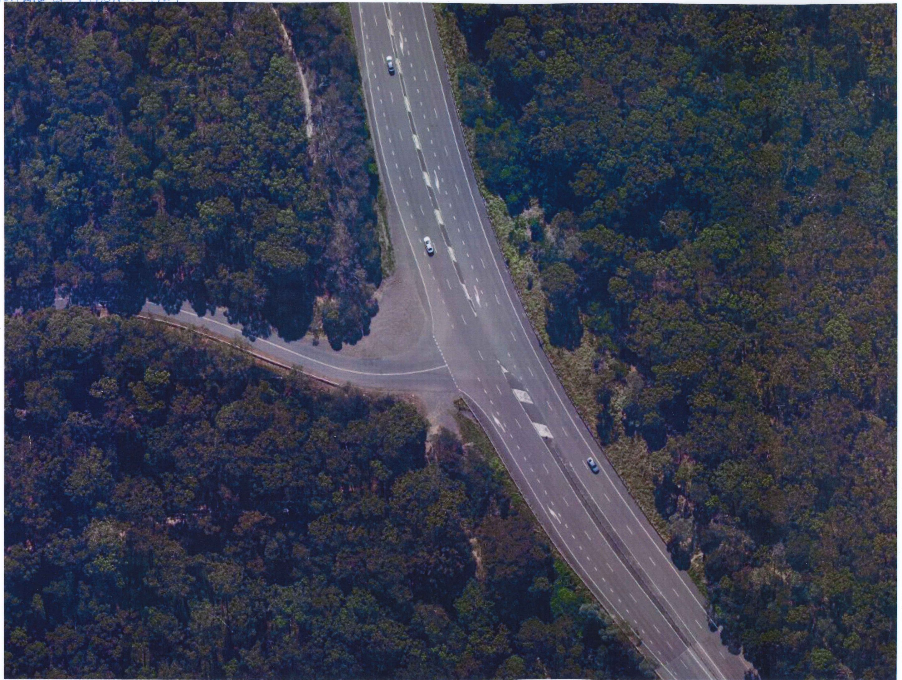
AWAZAKAL DR. | PACIFIC HWY