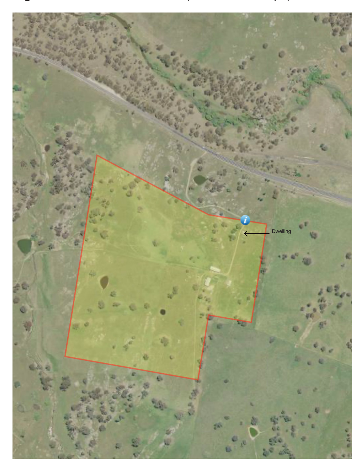
Figure 04 - Lot 143 DP753849

Where possible, screen planting has been shown as far as practically possible from the dwelling to maintain desirable outlooks whilst ensuring adequate screening. Visual screening location is indicative only and is proposed to be undertaken in consultation with the landowner post construction.