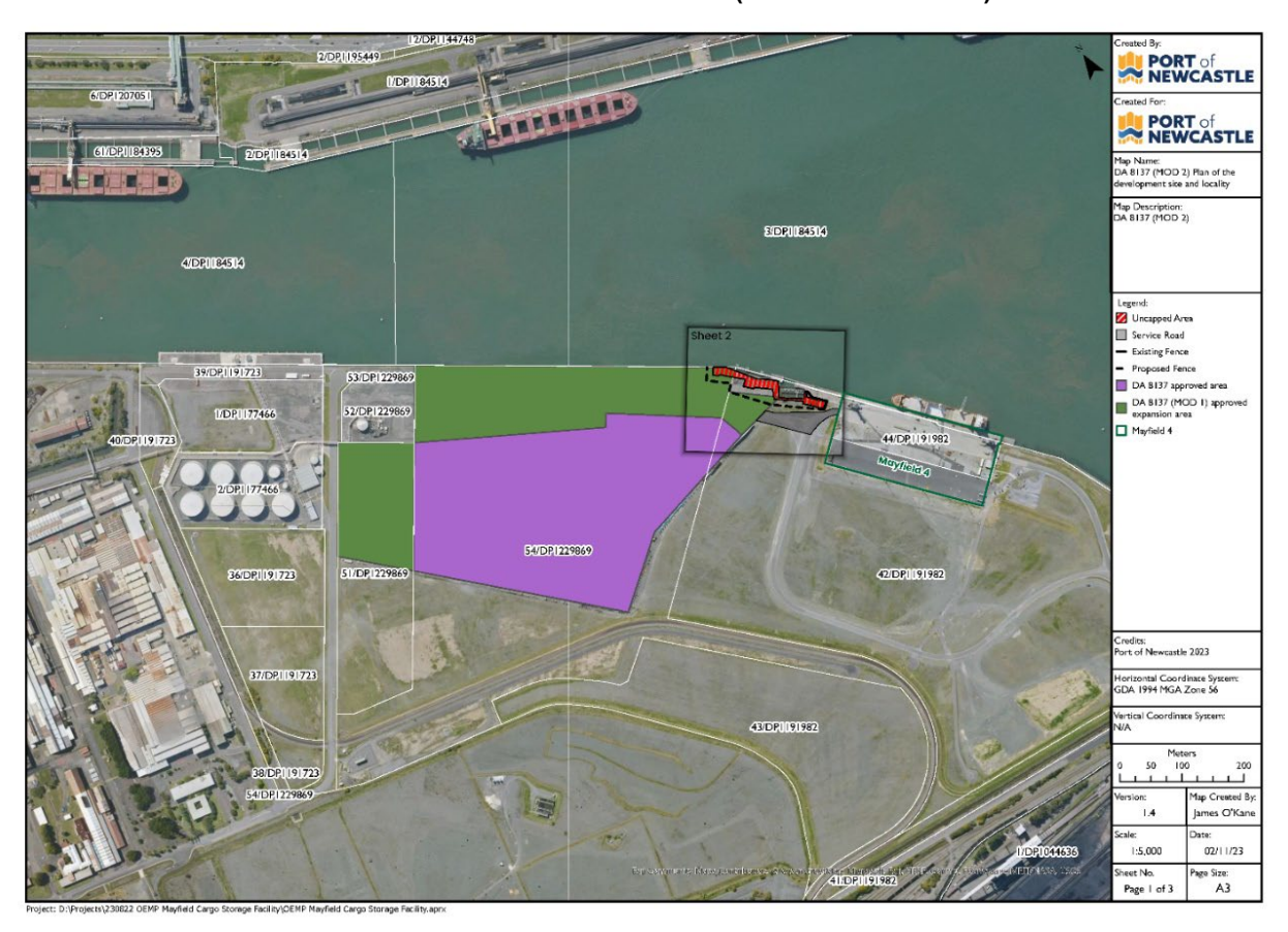
Figure 1 | Plan of the development site and locality