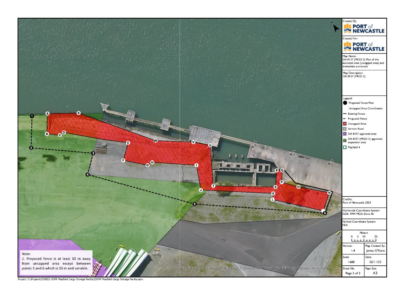
Figure 2 | Plan of the Excluded Area (uncapped area) and surrounds