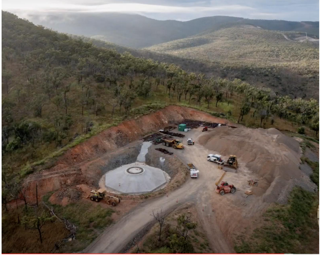
Example of turbine construction on sloping terrain

Turbines 64-70 need to be removed from the land adjoining Morrisons Gap Rd, a public road used for access for tourists to a trout farm, snow seekers, residents, and Council, Crown Lands, Forestry, National Park, and emergency services staff (SES/RFS/Ambulance). The project treats the road reserve like private property with proposed construction compounds immediately either side of the road, underground cabling and access tracks crossing the public road, and turbine foundations and laydowns, with no detail for significant earthworks.