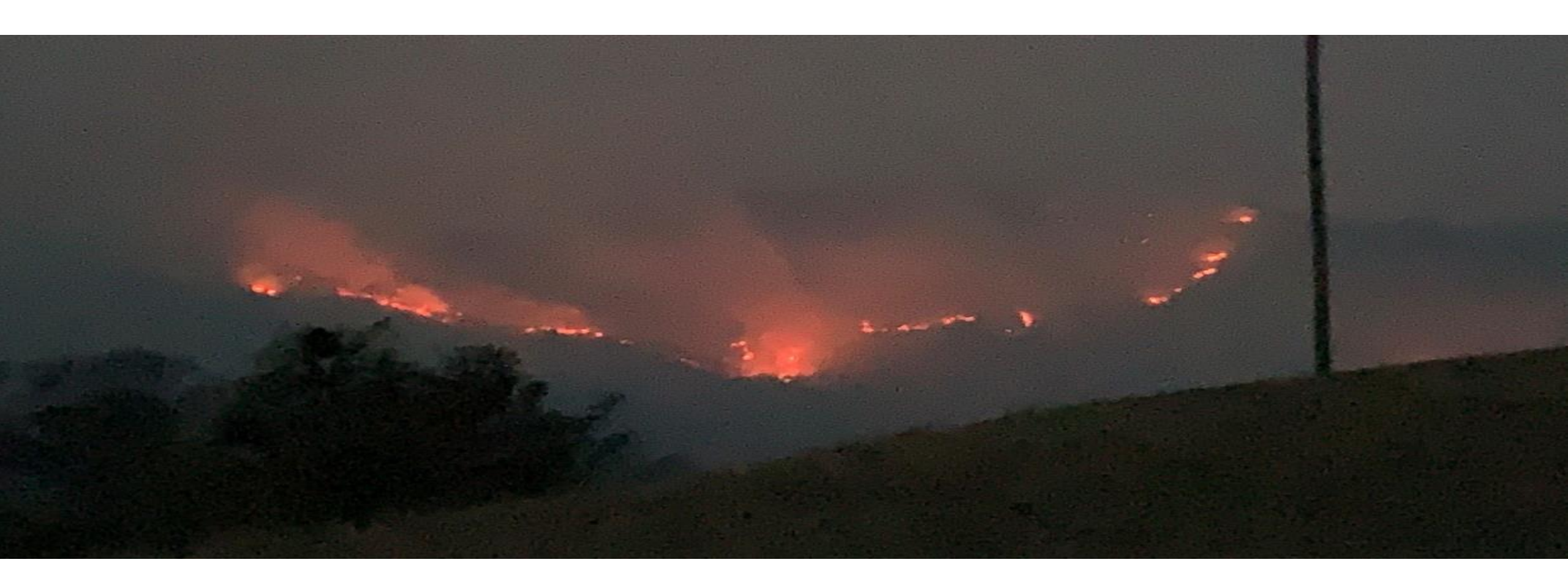
Image: 30 December 2019, taken from veranda at 281 Mountain View Road