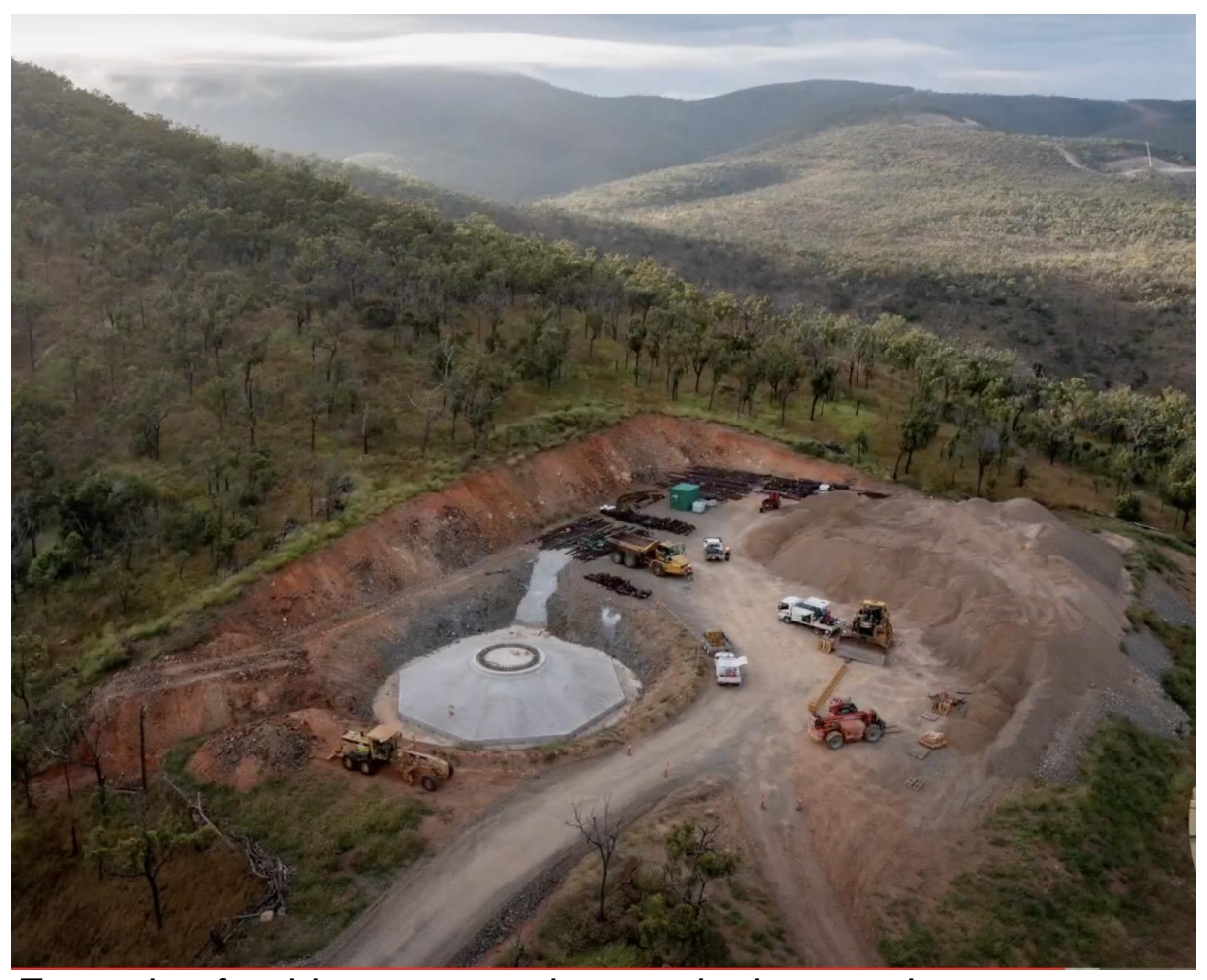
Example of turbine construction on sloping terrain

Turbines 64-70 need to be removed from the land adjoining Morrisons Gap Rd, a public road used for access for tourists to a trout farm, snow seekers, residents, and Council, Crown Lands, Forestry, National Park, and emergency services staff (SES/RFS/Ambulance). The project treats the road reserve like private property with proposed construction compounds immediately either side of the road, underground cabling and access tracks crossing the public road, and turbine foundations and laydowns, with no detail for significant earthworks.