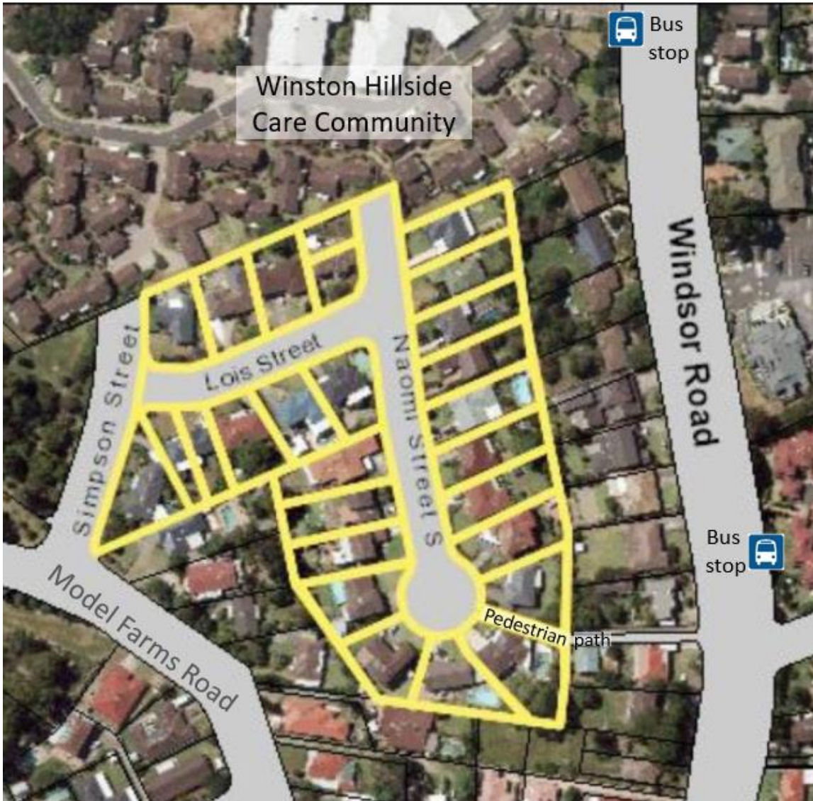
Figure 1 The subject sites, highlighted in yellow (source: planning proposal)

links the subject sites to Windsor Road. The sites are all within approximately 500 metre walking distance of existing bus stops on Windsor Road, which is a major bus corridor and Model Farms Road ( Figure 1 ).