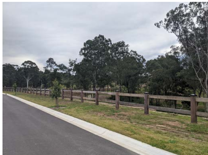
Adjoining site: 396 Bells Line of Road, Kurmond NSW 2757