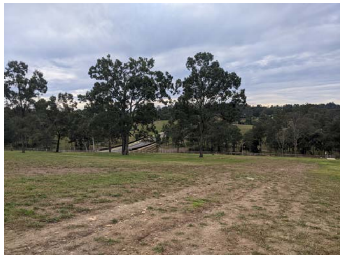
Site: 2 Inverary Drive, Kurmond NSW 2757