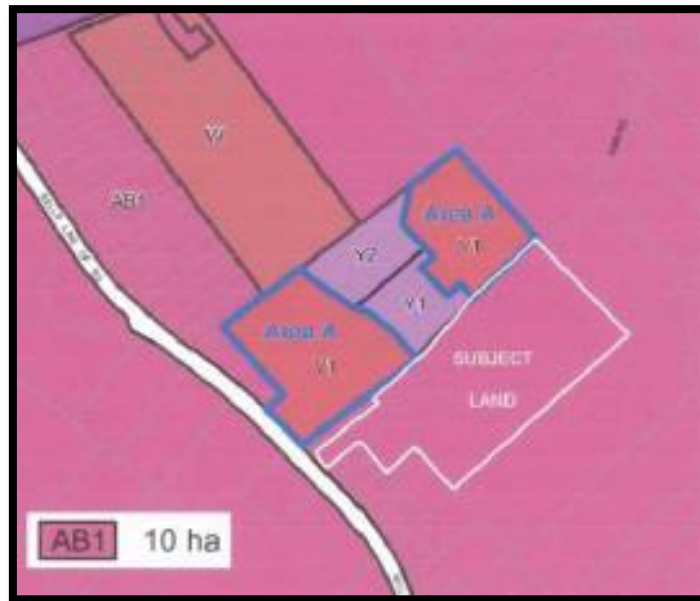
Figure 3: Lot Size Map