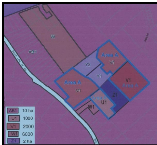
Figure 5: Application of Area A – subject to clause 4.1D

(b) the area of any lot created by the subdivision that contains or is to contain a dwelling house is less than 4,000 square metres.