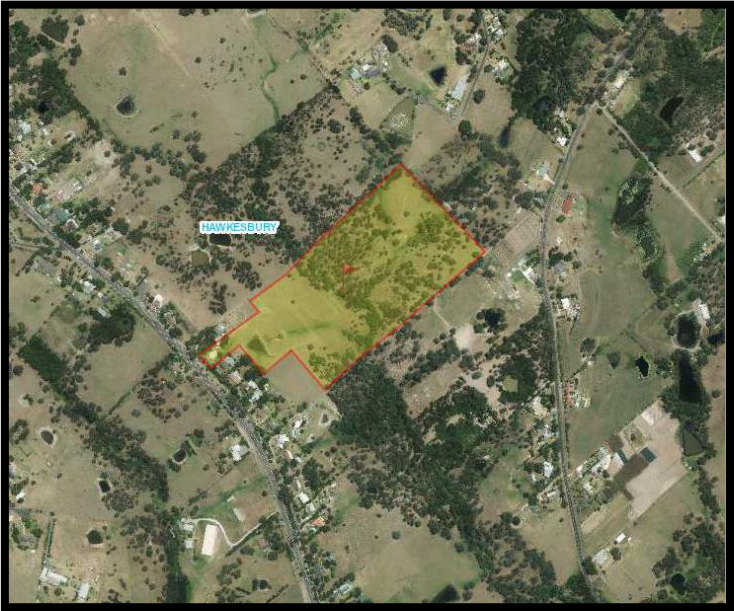
Figure 1: subject site highlighted in thin red outline.

The site, contains Shale Sandstone Transition Forest an endangered ecological community under the Biodiversity Conservation Act 2016 , as identified in the Flora and Fauna Assessment Report ( Attachment J ).