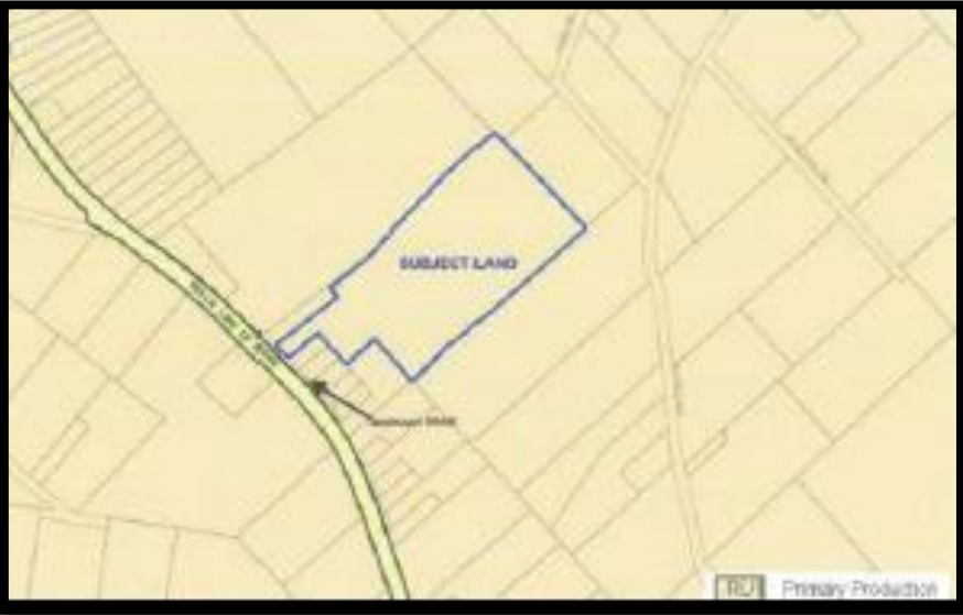
Figure 2: Land Zoning Map

Under the Hawkesbury Local Environmental Plan 2012, the site is currently zoned RU1 Primary production (refer to Figure 2), with a minimum lot size of 10 hectares (refer to Figure 3 - overleaf) and contains terrestrial biodiversity as identified on the Terrestrial Biodiversity map (refer to Figure 4 - overleaf).