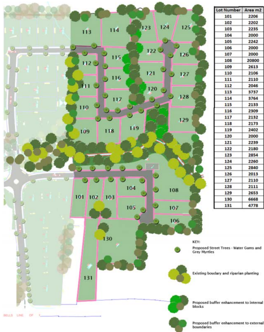
Figure 3 Revised Indicative Lot Layout