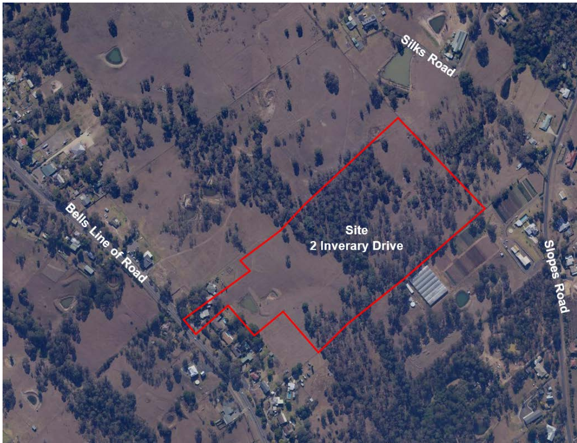
Figure 1 Site Context