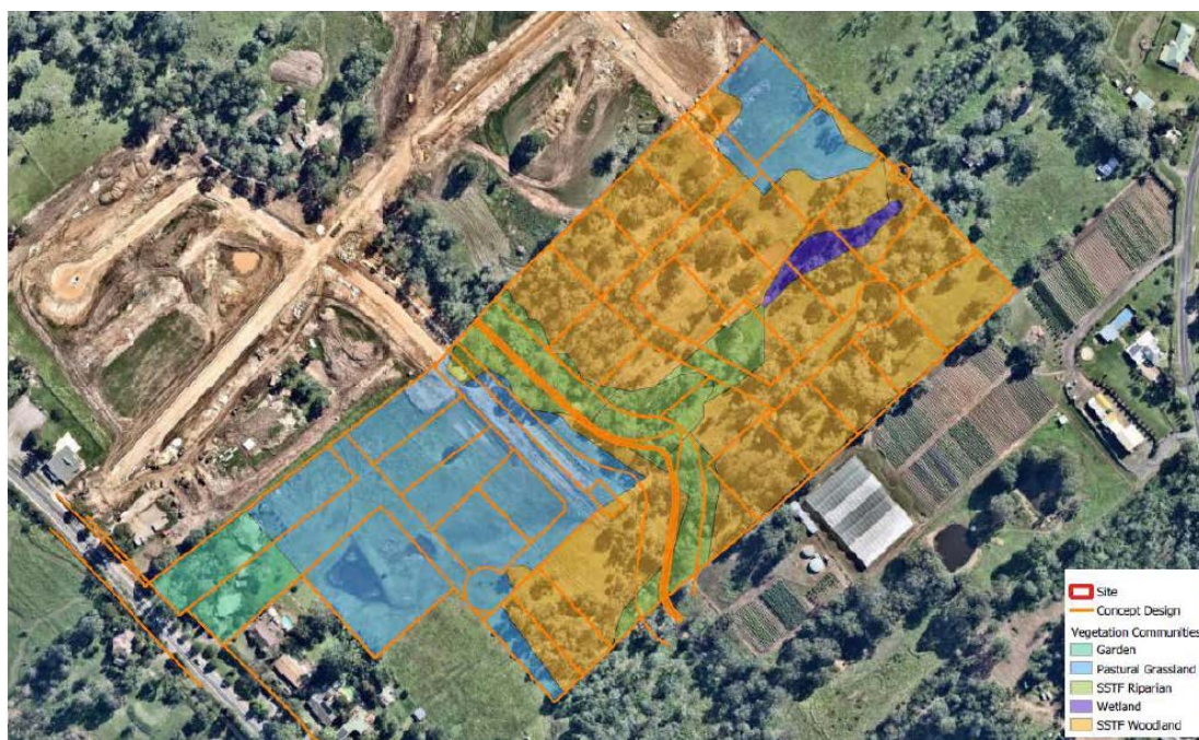
Figure 4 Ecological communities and proposed lot layout