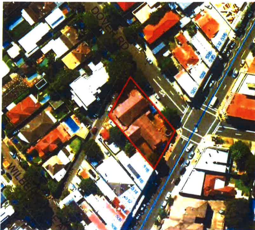
Figure 4: Aerial photograph showing the subject site outlined in red.