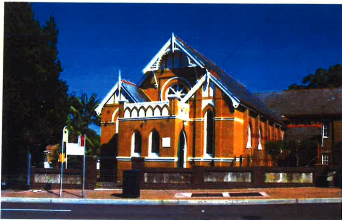
Figure 2: Rose Bay Uniting Church and the Wesley Hall at the rear.