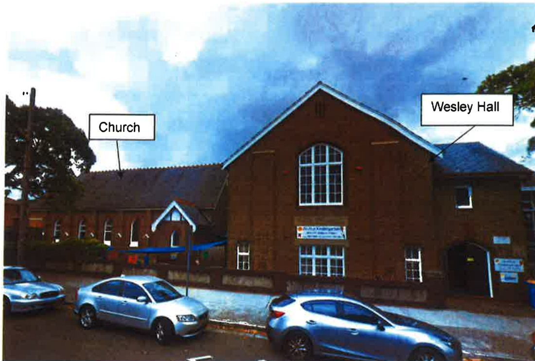
Figure 3: Rose Bay Uniting Church and Wesley Hall as viewed from Dover Road.