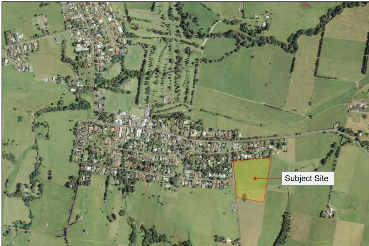
Figure 1: Site location at 123 Golden Valley Road, Jamberoo (Base source: SIX Maps)